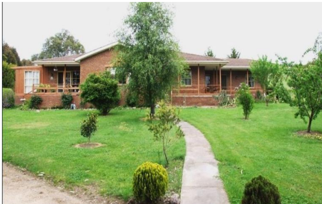
Photo of property 7 - 7 Troy Road, Waubra, Victoria

The value of the property has been significantly impacted by the presence of the wind farm.