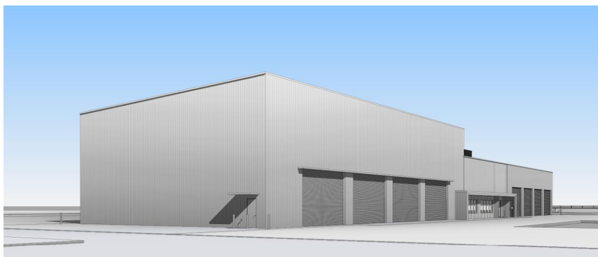
Figure 3 – Work Element 5 – New Mobile Threat Training Emitter Systems Maintenance Facility and Work Element 6 – Modifications to Existing Air Defence Radar System Storage Shelter, Delamere Air Weapons Range, Northern Territory.