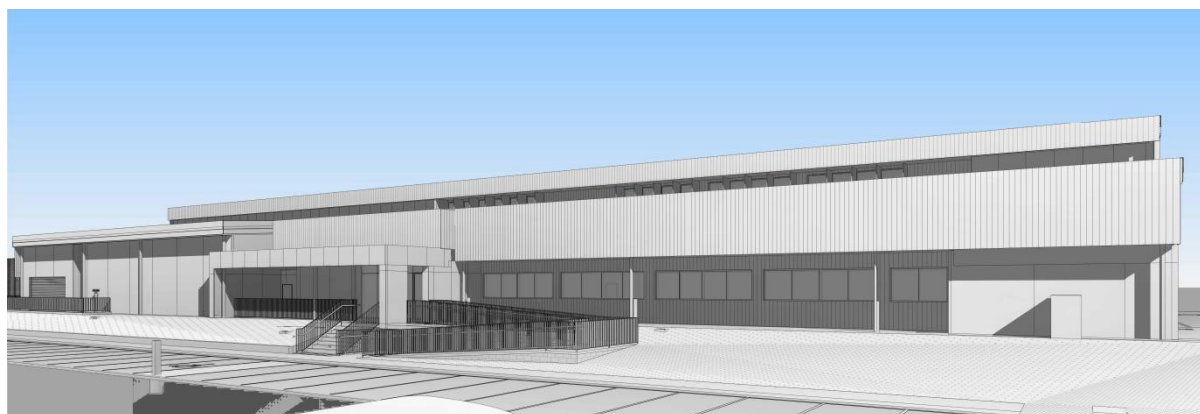
Figure 2 – Work Element 4 – Mission Control Centre, RAAF Base Amberley, Queensland.