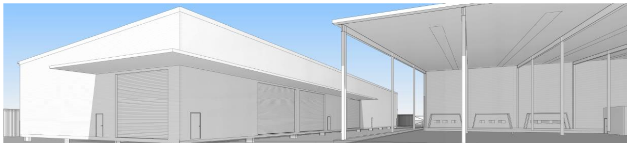
Figure 1 – Work Element 1 – Upgrades to Existing Next Generation Jammer Maintenance Facility, Work Element 2 – New Next Generation Jammer Secure Ready Storage Facility and Work Element 3 – New Next Generation Jammer Container and GSE Storage, RAAF Base Amberley, Queensland.