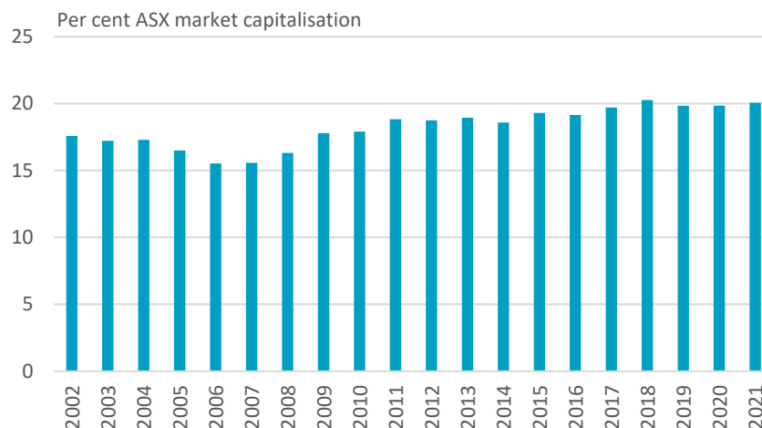
Chart 1: Total institutional superannuation fund investments in listed Australian equities Share of ASX market capitalisation, as 30 June