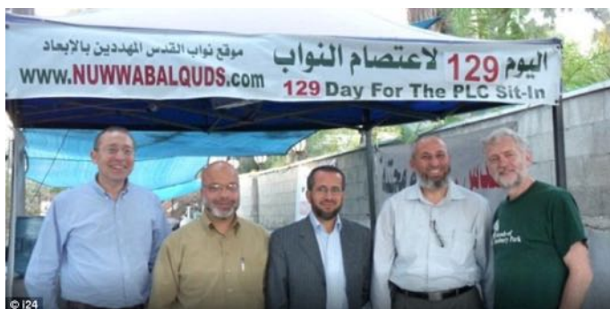
Jeremy Corbyn MP and Andy Slaughter MP pose with Hamas officials in Ramallah

Mr Corbyn has previously referred to Hamas as his friends. For example, in a speech to a Stop the War Coalition event in 2009, Mr Corbyn described Hamas (and the terrorist group Hizballah) as his "friends", saying it would be his "honour and pleasure" to host their operatives in Parliament. In 2016, under pressure over antisemitism in his Party, Mr Corbyn said that he regretted his words.