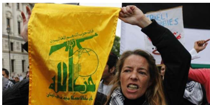
Hizballah flag displayed on the streets of London, a practice that is now outlawed

and also arrest anybody who publishes photographs of them. Significantly, it also meant that Hizballah assets in the UK could be frozen, which HM Treasury did in 2020.