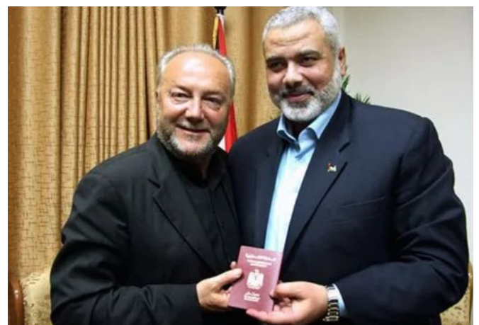
George Galloway receives a passport from Hamas Prime Minister Ismail Haniyeh

In 2009, Mr Galloway was reportedly described by one Hamas official as a "hero" and was awarded a passport by the Hamas Prime Minister, Ismail Haniyeh, in "deep appreciation" of his support.