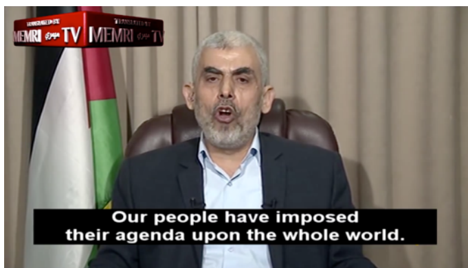
Yahya Ibrahim Hassan Sinwar

By way of more recent example, consider that, in March 2021, Yahya Ibrahim Hassan Sinwar, a former commander and founding member of Hamas' armed apparatus, was re-elected as the leader of Hamas in the Gaza Strip for a second four-year term, a role that oversees the group's political activities as well.