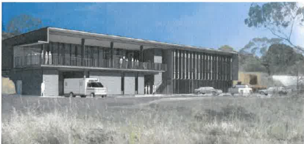
MEDICAL AND ENABLING SERVICES FACILITY (ARTIST'S IMPRESSION)

HMAS Watson provides a wide range of specialist courses and tactical training for approximately 1,300 Navy personnel each year.