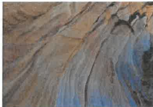
ROCKS AT WATSONS BAY