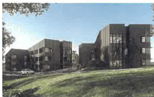
LIVE-IN ACCOMMODATION (ARTIST'S IMPRESSION)