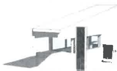
FRONT ENTRY GUARD HOUSE UPGRADE (ARTIST'S IMPRESSION)