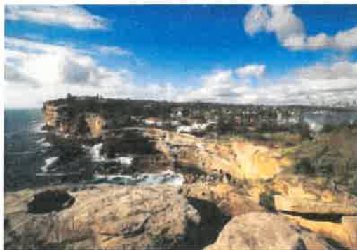
ENVIRONMENT OF WATSONS BAY