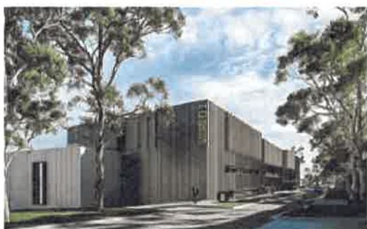
TRAINING PRECINCT (ARTIST'S IMPRESSION)

To minimise the impact on the community during construction and make sure day to day operations can continue, the works will be staged over the construction period.