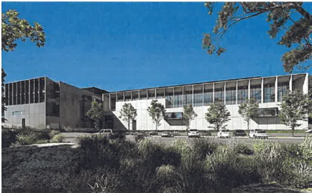
TRAINING PRECINCT (ARTIST'S IMPRESSION)

The project will not have a significant noise and vibration impact. While some construction activities during certain phases of the work may exceed noise management levels, there will be minimal impact to the surrounding community.