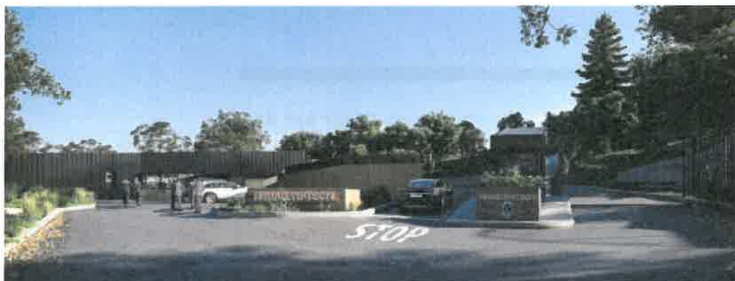
FRONT ENTRY PASS OFFICE UPGRADE (ARTIST'S IMPRESSION)