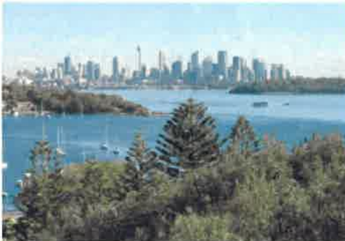
VIEW OF SYDNEY CBD