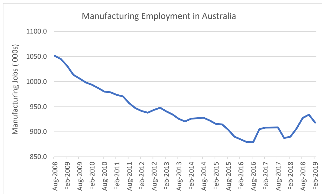
Graph 1 Total Manufacturing Employment in Australia, ABS Labour Force 6291.0.55.003

It is no secret that the manufacturing sector has faced significant head winds. Graph 1 depicts total manufacturing employment in Australia over the last decade. From a peak of 1.05 million manufacturing workers in August 2008 the sector has contracted to just over 918,000 by February 2019. This is a decrease of 133,000 manufacturing jobs or 13 per cent.