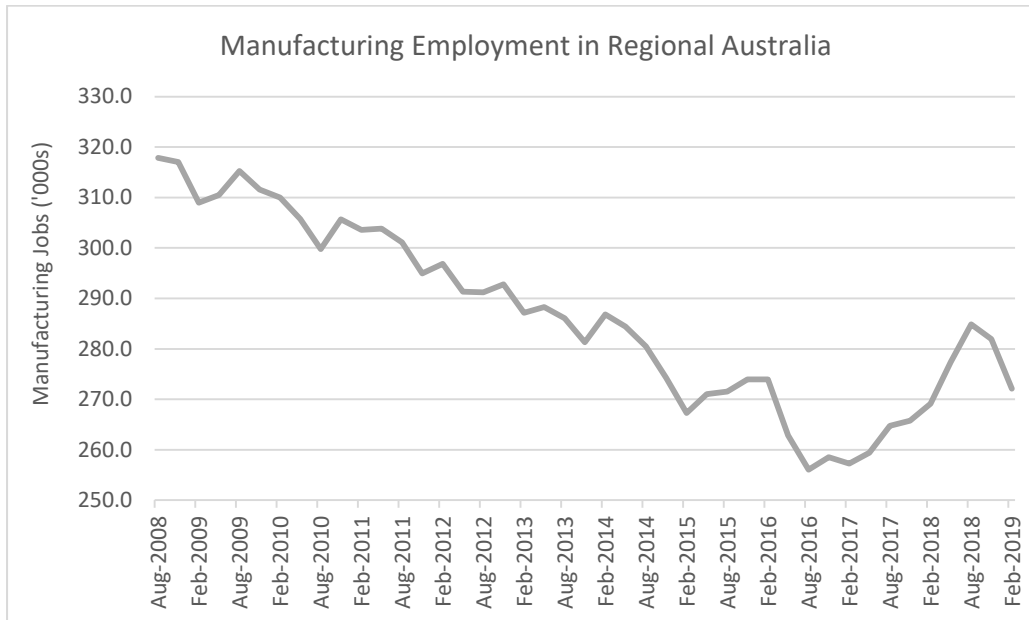
Graph 2 Regional Manufacturing Employment in Australia, ABS Labour Force 6291.0.55.003

The decline in regional manufacturing over the last decade has mirrored the broader sector nationally. It dropped from almost 318,000 in mid-2008 to 272,000 in February 2019. This was a 14.4 per cent decrease in regional manufacturing jobs, outpacing the rate of total sector decline.