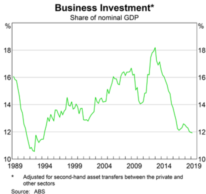
Graph 4 – Manufacturing Business Investment in Australia, ABS 8

There is a distinct gap in Australia's finance market that has seen the tap turned off for manufacturing companies. The capital for both manufacturing starts ups and already existing companies seeking to expand has not been readily available. This is particularly the case for SMEs who require the additional capital to expand their businesses, employ more workers and compete on a global playing field.