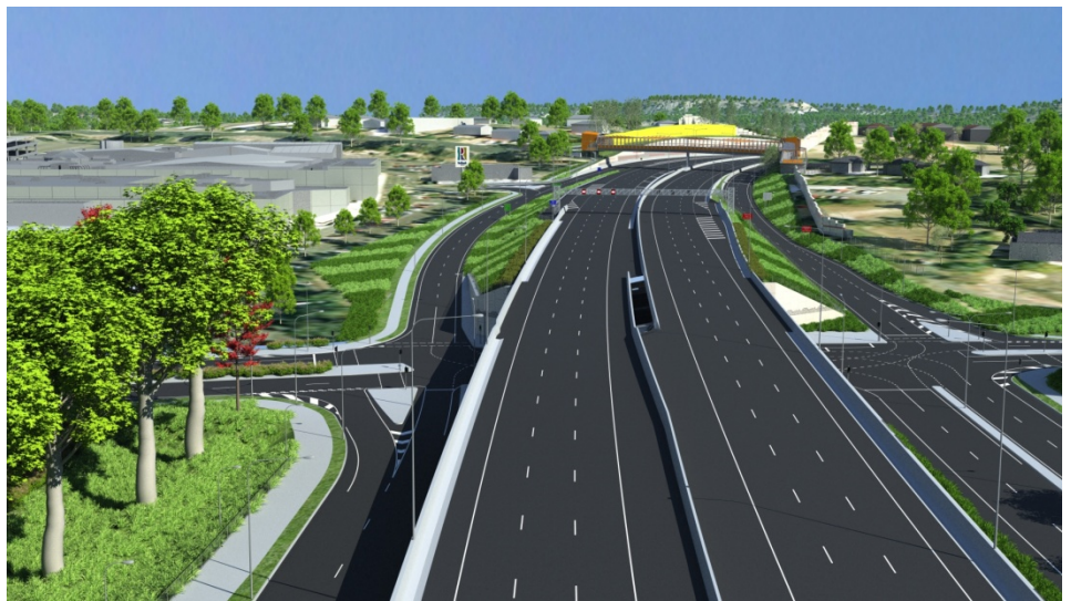
3ds Max Design visualization model.