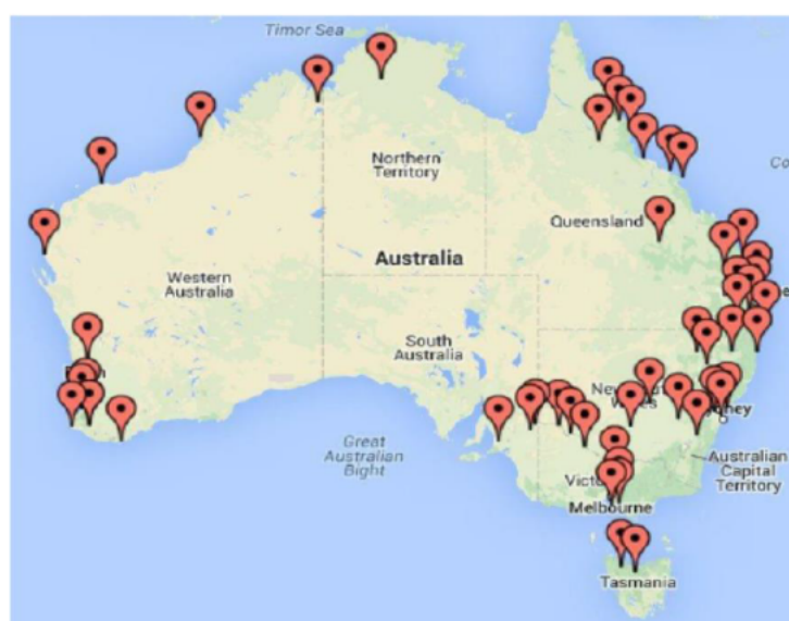
Map 1: Destinations of Seasonal Workers