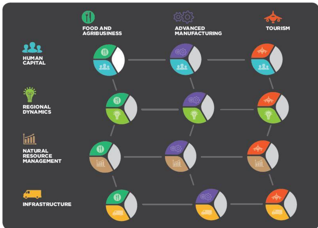
Figure 2: Regional Futures Plan Matrix. Horizontal axis sets out the proposed Pillar Industries and vertical axis depict proposed Foundation Sectors.

In April 2015 NTD released the Regional Futures Plan – Directions Paper for comment. The Directions Paper sets a suggested framework to grow the region. This framework is based around a matrix system that has three Pillar industries which are supported by four core foundation sectors.