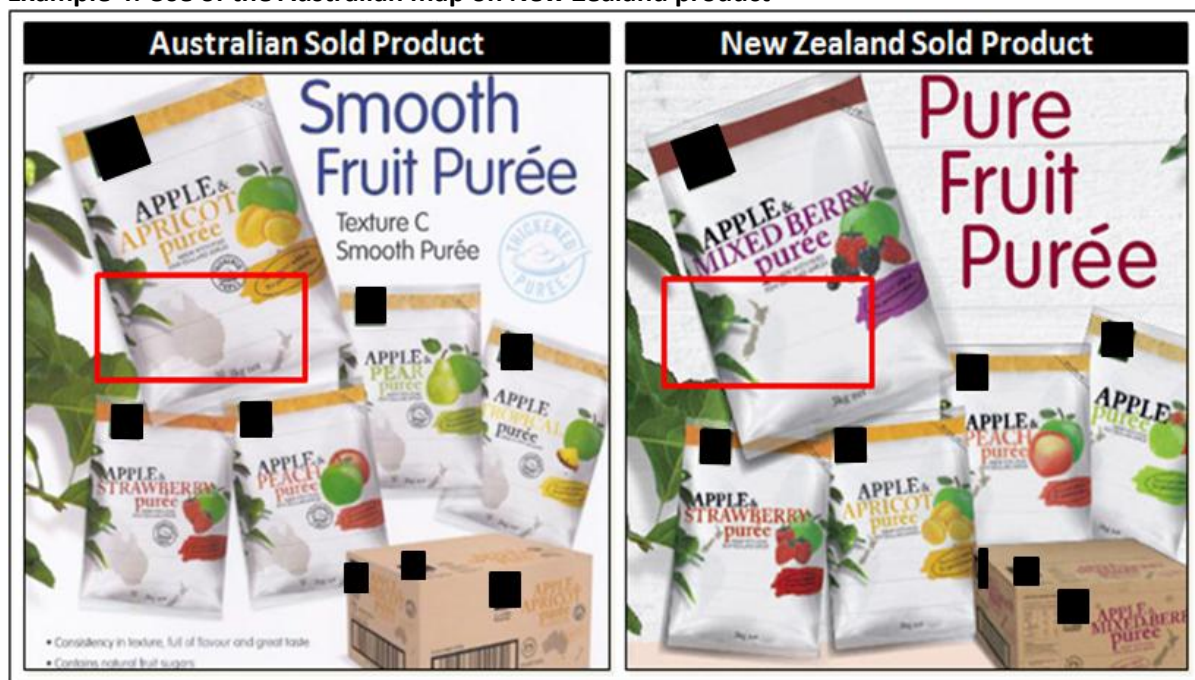
Example 4: Use of the Australian map on New Zealand product

'Made in Australia' label can be used by the businesses when all or some of its ingredients are imported as long as the product is ' substantially transformed in Australia and at least 50 per cent of the cost of production has been incurred in Australia. ' This is often not clearly understood by consumers.