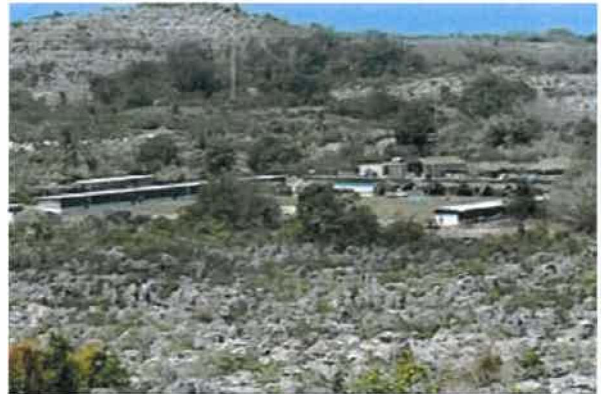
The Australian detention centre on the Pacific island of Nauru.

On its website, Ronphos claims that the "demand for Nauru rock is overwhelming".