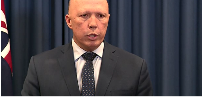
Peter Dutton, the Australian home affairs minister, said of deportees: "It's taking out the trash, then we can make Australia a safer place".