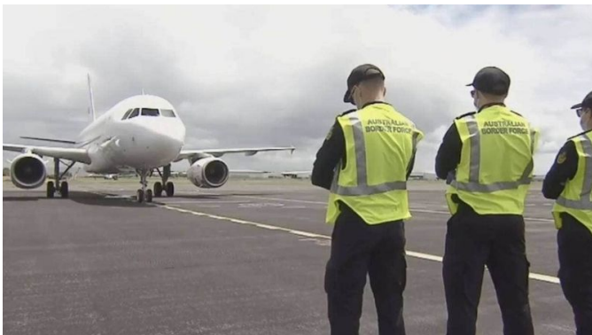
The flight from Australia flew a new batch of deportees to Auckland last week. (Nine)

READ MORE: NZ marks two years since Christchurch shooting