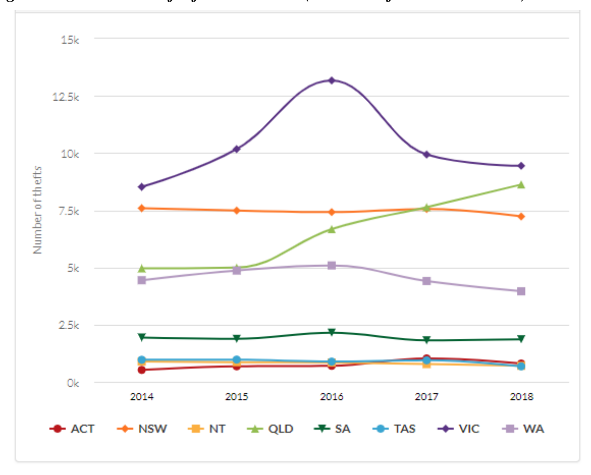
Figure 1: Short-term theft of PLC vehicles (trend data from 2014 to 2018)<sup>18</sup>