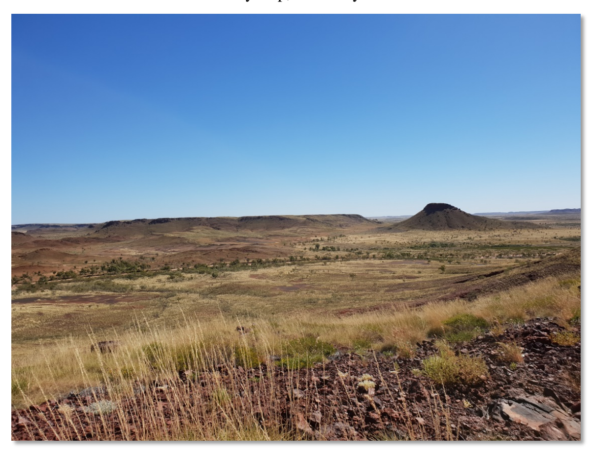
A view overlooking some rehabilitated areas of former iron ore mine sites in the BHP Northern Tenements area.