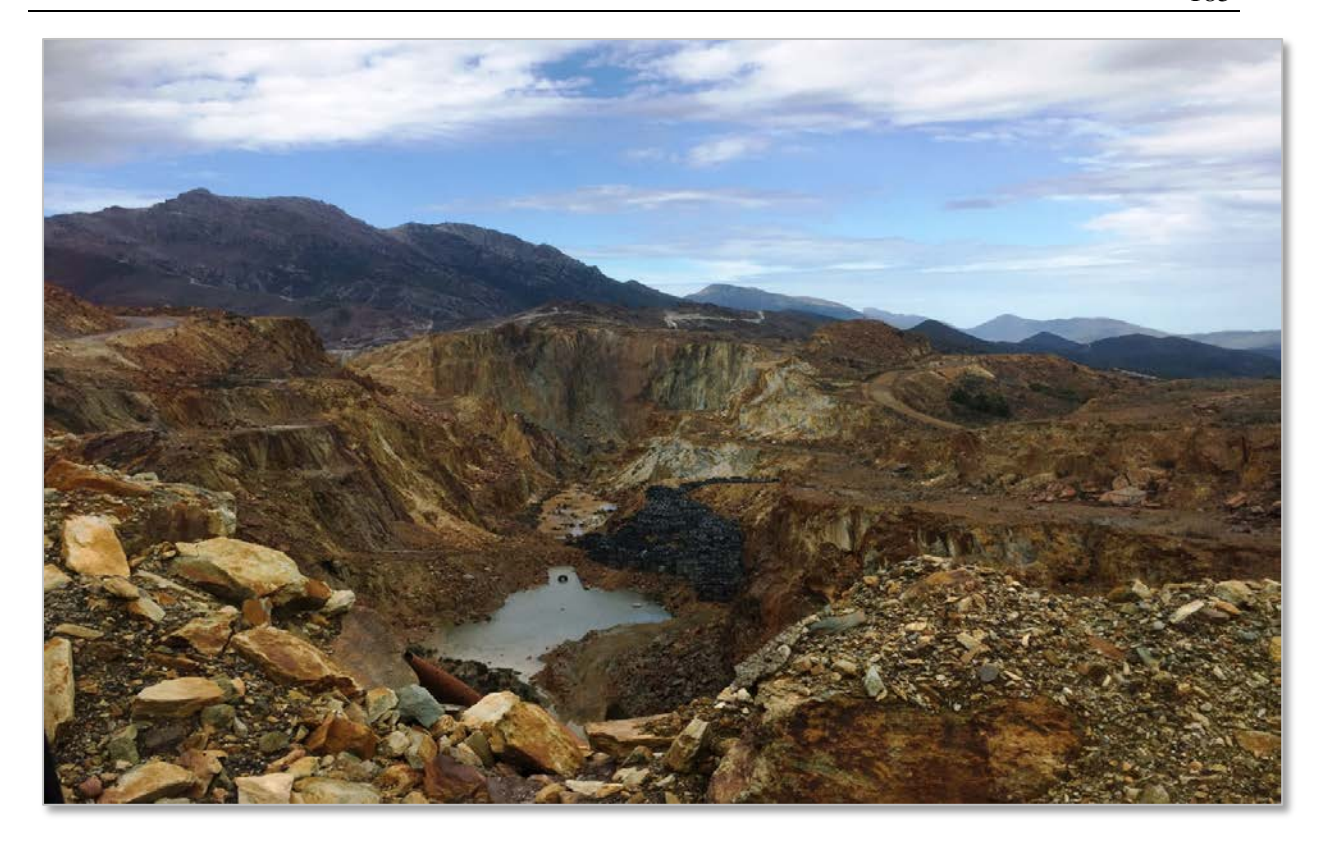
Historically mined areas at the Mt Lyell Copper Mine, including an old tyre dump (centre).