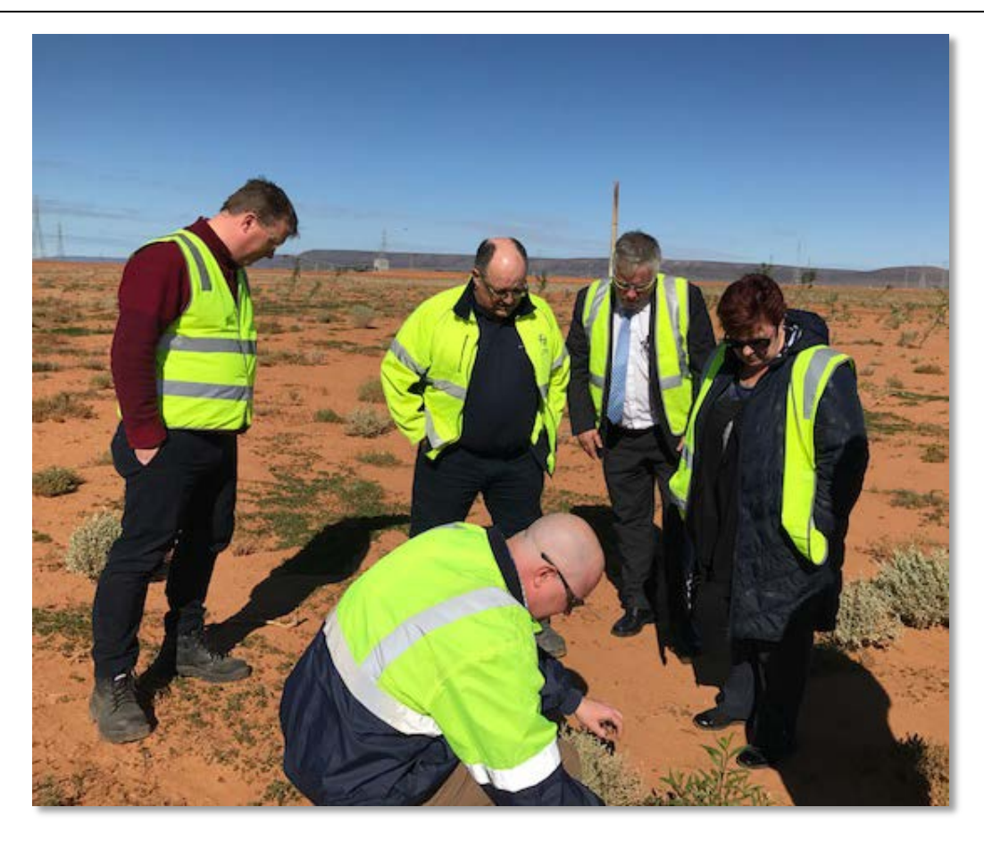
Senators Urquhart and Patrick examine revegetation on top of the former ash dam, with representatives from Flinders Power.