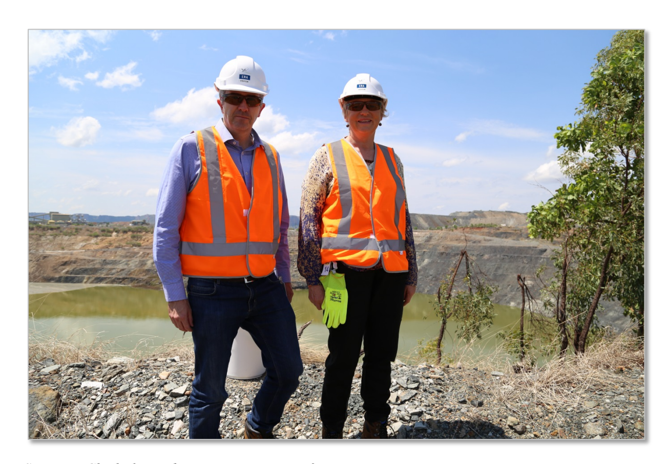
Senators Chisholm and Rice inspecting Pit 3 at Ranger Uranium Mine.

• the trial landform area, where four different combinations of surface materials and many species have been trialled in order to determine the optimal approach to constructing the final landforms for Pits 1 and 3 once backfilling has been completed.