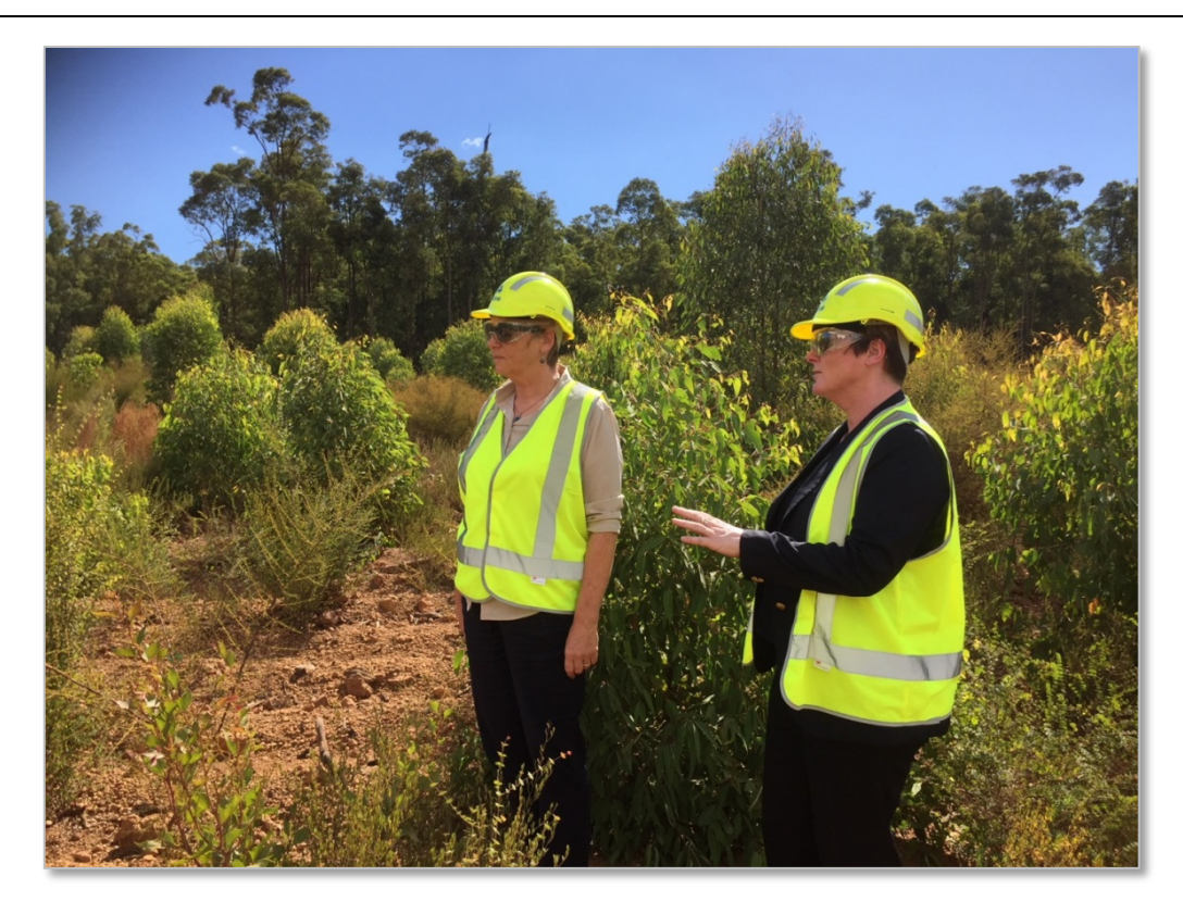
Senators Rice and Reynolds inspecting a site where rehabilitation commenced in 2014.