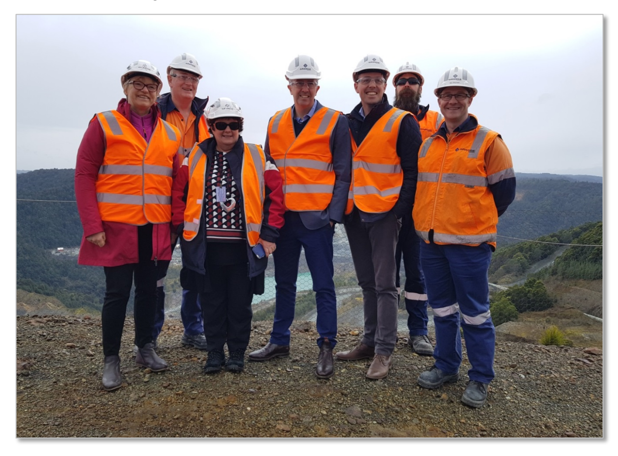
Senators Rice, Urquhart, Chisholm and Duniam with Grange Resources staff, overlooking current pit operations at Savage River mine.

The role of the South Deposit Tailings Storage Facility was highlighted during the site visit. This facility has the capacity to capture legacy seepage from historic waste rock dumps and co-treat it with fresh tailings from mining operations in order to neutralise the acid mine drainage.