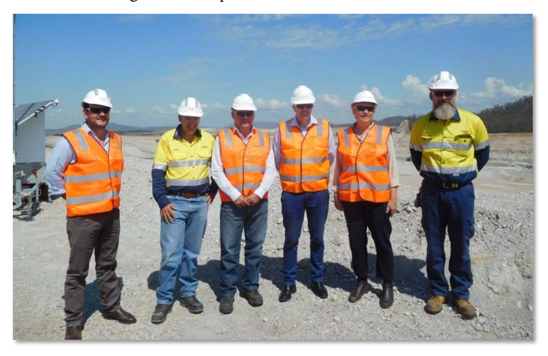
Senators Rice and Chisholm with Glencore staff, viewing open cut operations at Mangoola Coal Mine.

Glencore noted that it used Geographic Information System mapping to monitor rehabilitation progress at the site. It further noted that it has also introduced rehabilitation targets into the Key Performance Indicators and performance bonus schemes for site managers to drive performance in this area.