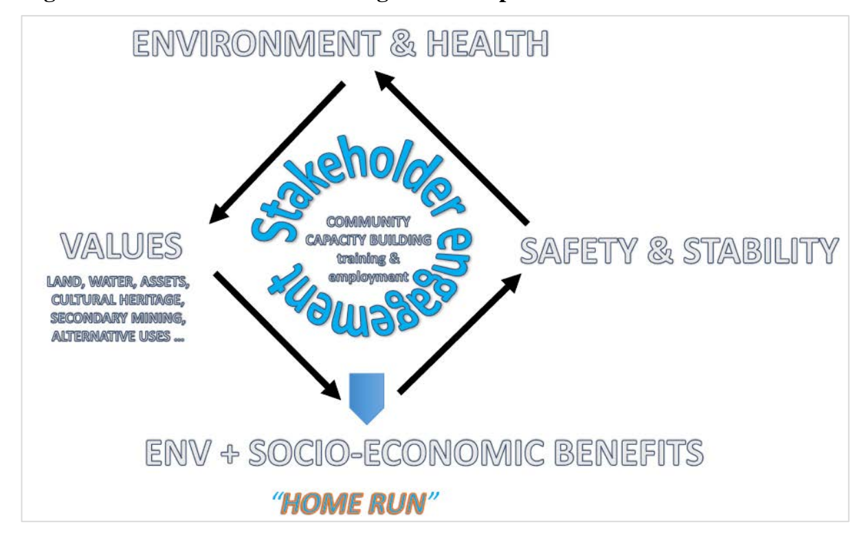
Figure 5.1: Abandoned mine management components<sup>17</sup>

5.16 Ms Unger described such a program as follows: