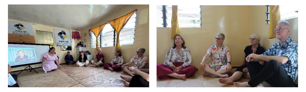
President Lines and delegation in discussion with the Fatu Lei team.

The delegation visited 'Tuvalu Women for Change', a gender-focused civil society organisation based in Funafuti. The centre was established in 2019 with funding from the Australian Government.<sup>8</sup>