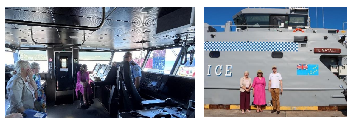
Presentation on the bridge by the GCPB's commanding officer.