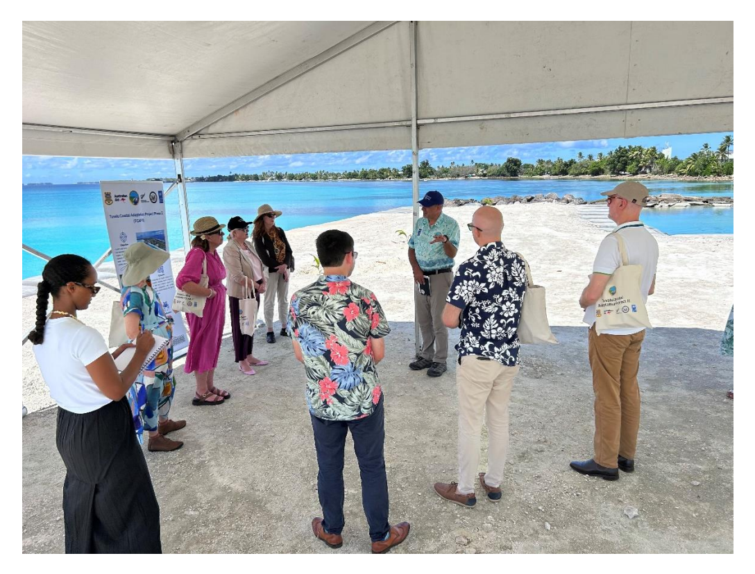
Delegation receiving a briefing at the TCAP II site.

The reclaimed land will be given to the government of Tuvalu and will provide space for housing and other essential public services.