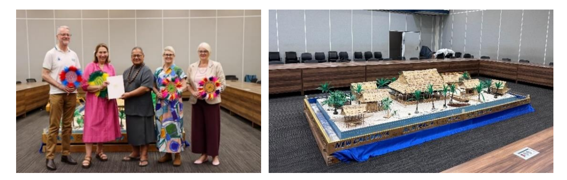
Delegation members with the Speaker of the Parliament of Tuvalu. The Parliament currently sits in a multi-purpose use building, with a model of a traditional village in the centre of the chamber.