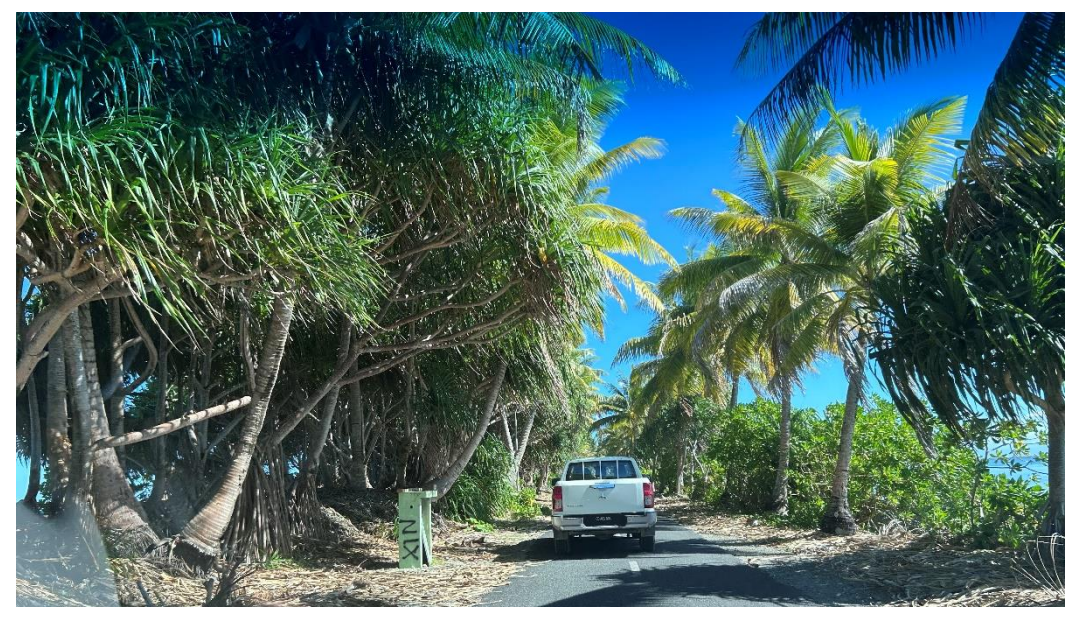
The above photo highlights the narrow width of Tuvalu with the lagoon on the left and the ocean to the right.

UNDP representatives accompanied the delegation on a tour to the Funafuti atoll causeway. The islet where main settlements are situated<sup>4</sup>, has a width of around 400 metres at its greatest and around 20 metres at its narrowest and demonstrates the effects of coastal erosion and the threat that sea-level rise poses to Tuvalu<sup>5</sup>.