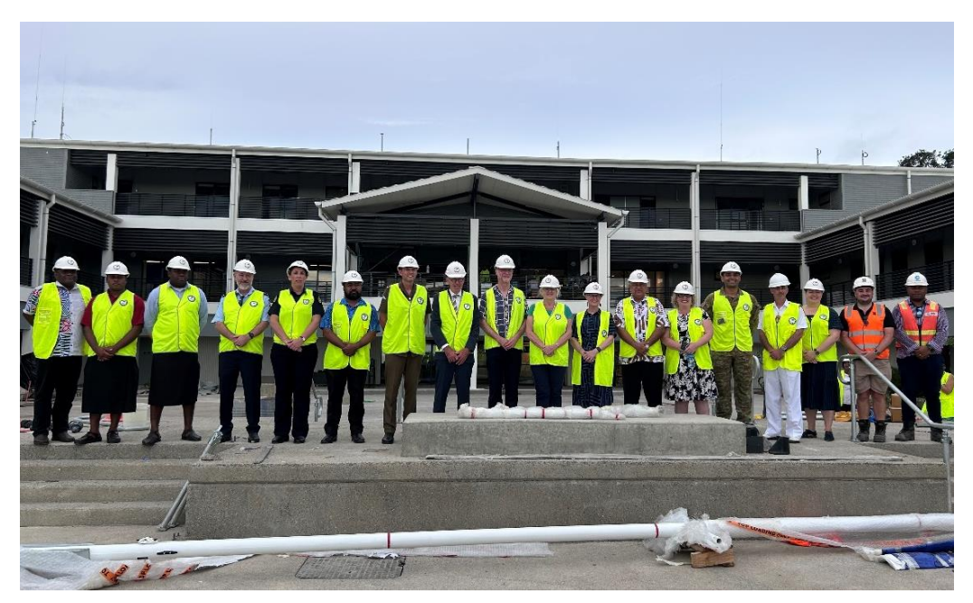
Delegation with Australian Defence Force personnel and contractors at the MESC construction site.

The delegation visited the Australian Government funded Maritime Essential Services Centre (MESC)<sup>14</sup> construction site. The Centre is scheduled for completion and handover to the Fiji Government in the first half of 2025. The MESC will be a multipurpose facility housing the headquarters of the Fijian Navy, the Rescue Coordination Centre, Suva Coastal Radio Station and Fiji Hydrographic Office.<sup>16</sup> The centralisation of these services will strengthen maritime security cooperation between Australia and Fiji and improve Fijian Government interagency collaboration through information sharing, coordination of maritime planning, conduct of training, and humanitarian and disaster relief operations.