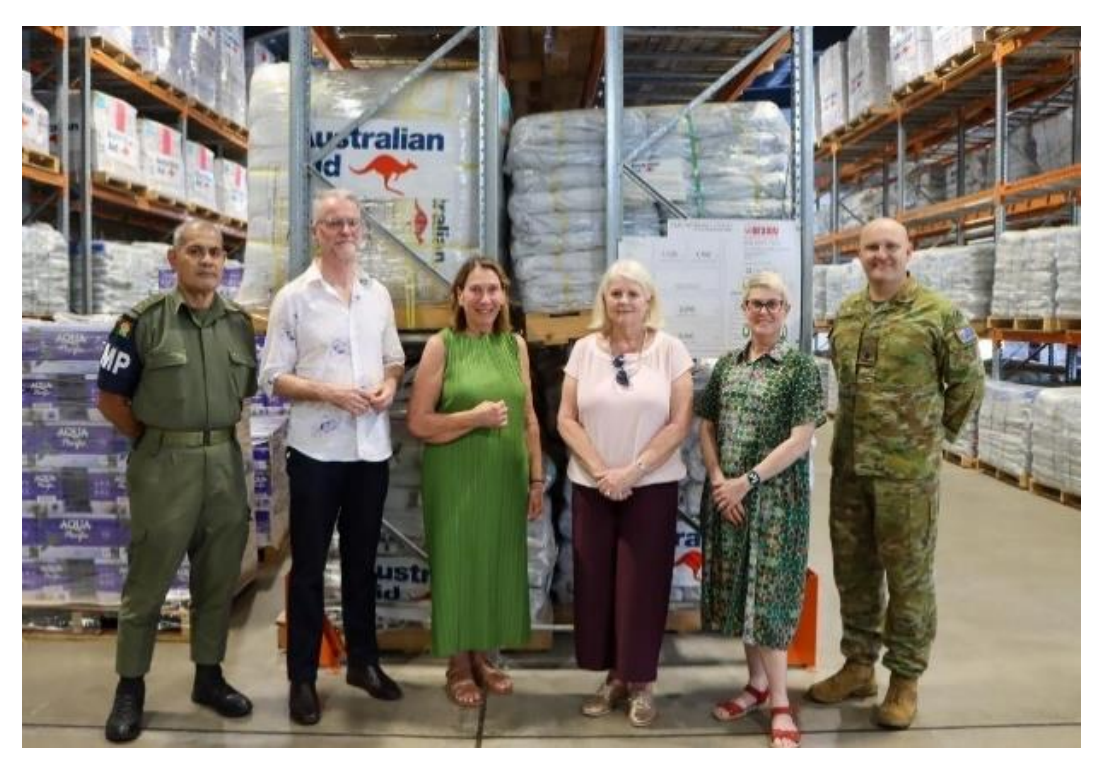
President Lines and delegation at the Blackrock Peacekeeping and HADR Camp

The delegation visited the Blackrock Peacekeeping and Humanitarian Assistance and Disaster Relief (HADR) Camp outside Nadi. The redevelopment of the Camp was jointly funded by Australia and Fiji for the Republic of Fiji Military Forces. The Camp was officially opened in March 2022. The camp provides a training and regional response hub for natural and man-made disasters. It also hosts predeployment training of Fijian peacekeepers and joint exercises for the UN missions.<sup>19</sup>