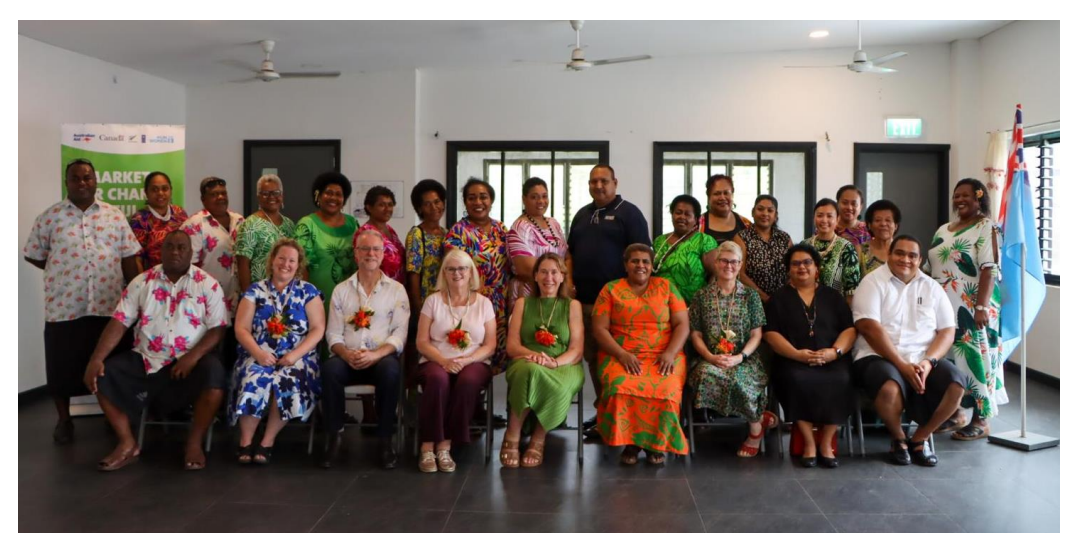
President Lines and delegation at the Nausori Accommodation Centre

The delegation visited the Nausori Municipal Markets<sup>16</sup> and met with vendor representatives. The visit included a tour of the Nausori Accommodation Centre<sup>17</sup> to learn about the facility, a joint Fijian – Australian initiative, opened in 2022 to provide secure accommodation to vendors who travel from remote locations to sell products at the markets.<sup>18</sup>