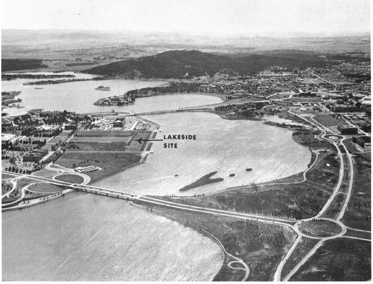
Aerial views of Lake Burley Griffin, October 1967