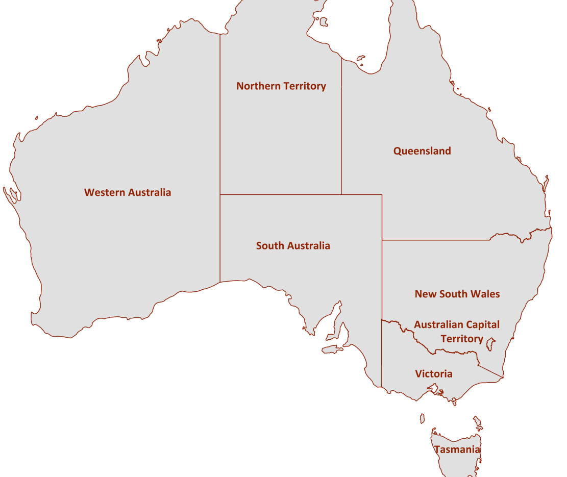
New South Wales