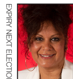
McCARTHY, The Hon. Slade (ALP)