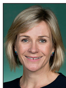
STEGGALL, Zali MP Warringah