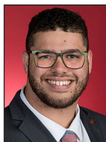
STEELE-JOHN, Senator Jordan WA