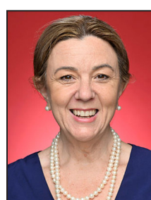
TYRRELL, Senator Tammy TAS