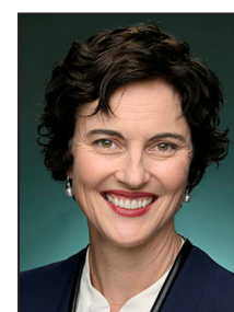
CHANEY, Kate MP Curtin