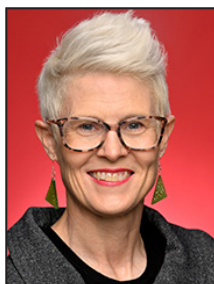
ALLMAN-PAYNE, Senator Penny QLD