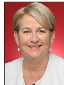
POCOCK, Senator Barbara SA