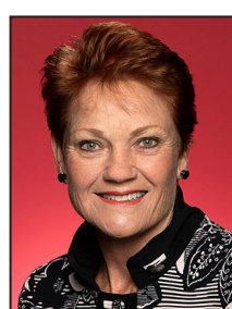
HANSON, Senator Pauline QLD