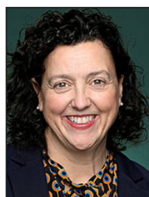
RYAN, Monique MP Kooyong