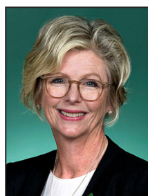
HAINES, Helen MP Indi