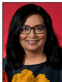
FARUQI, Senator Mehreen NSW