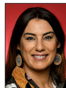
THORPE, Senator Lidia VIC