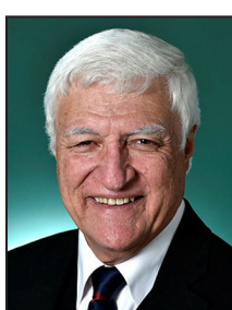
KATTER, The Hon. Bob MP Kennedy