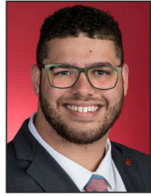
STEELE-JOHN, Senator Jordon WA