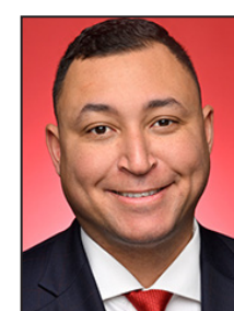
BABET, Senator Ralph VIC

This product will be updated as official photos are published.