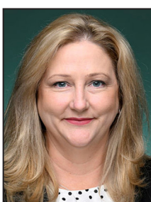
SHARKIE, Rebekha MP Mayo