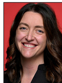
HODGINS-MAY Senator Steph VIC