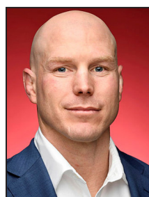
POCOCK, Senator David ACT