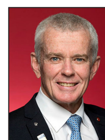
ROBERTS, Senator Malcolm QLD