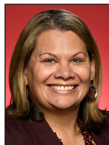
COX, Senator Dorinda WA