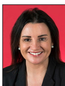
LAMBIE, Senator Jacqui TAS