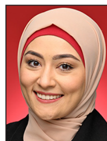
PAYMAN, Senator Fatima WA