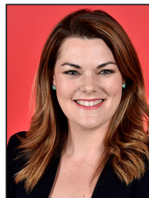
HANSON-YOUNG, Senator Sarah SA