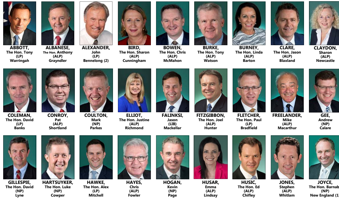
ABBOTT , The Hon. Tony (LP) Warringah ALBANESE , The Hon. Anthony (ALP) Grayndler ALEXANDER , John (ALP) Bennelong (2) BIRD , The Hon. Sharon (ALP) Cunningham BOWEN , The Hon. Chris (ALP) McMahon BURKE , The Hon. Tony (ALP) Watson BURNEY , The Hon. Linda (ALP) Barton CLARE , The Hon. Jason (ALP) Blaxland CLAYDON , Sharon (ALP) Newcastle COLEMAN , The Hon. David (LP) Banks CONROY , Pat (ALP) Shortland COULTON , Mark (NP) Parkes ELLIOT , The Hon. Justine (ALP) Richmond FALINKSI , Jason (ALP) Mackellar FITZGIBBON , The Hon. Joel (LP) Hunter FLETCHER , The Hon. Paul (LP) Bradfield FREELANDER , Mike (ALP) Macarthur GEE , Andrew (NP) Calare GILLESPIE , The Hon. David (LP) Lyne HARTSUYKER , The Hon. Luke (NP) Cowper HAWKE , The Hon. Alex (ALP) Mitchell HAYES , Chris (ALP) Fowler HOGAN , Kevin (NP) Page HUSAR , Emma (ALP) Lindsay HUSIC , The Hon. Ed (NP) Chifley JONES , Stephen (ALP) Whitlam JOYCE , The Hon. Barnaby (ALP) New England (1) KELLY , Craig (LP) Hughes KELLY , The Hon. Mike (ALP) Eden-Monaro LAUNDY , Craig (LP) Reid LEESER , Julian (LP) Berowra LEY , The Hon. Susan (ALP) Farrer McBRIDE , Emma (ALP) Dobell