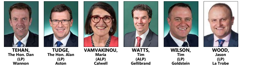
TEHAN , The Hon. Dan (LP) Wannon TUDGE , The Hon. Alan (LP) Aston VAMVAKINO , Maria (ALP) Calwell WATTS , Tim (ALP) Gellibrand WILSON , Tim (ALP) Goldstein WOOD , Jason (LP) La Trobe ANDREWS , The Hon. Karen (ALP) McPherson BUCHHOLZ , Scott (LP) Wright BUTLER , Terri (ALP) Griffith CHALMERS , Jim (ALP) Rankin CHRISTENSEN , George (NP) Dawson CIOBO , The Hon. Steven (LP) Moncrieff DICK , Milton (ALP) Oxley DUTTON , The Hon. Peter (LP) Dickson ENTSCH , The Hon. Warren (LP) Leichhardt EVANS , Trevor (LP) Brisbane HOWARTH , Luke (LP) Petrie KATTER , The Hon. Bob (KAP) Kennedy LAMB , Susan (ALP) Longman (7) LAMING , Andrew (LP) Bowman LANDRY , Michelle (NP) Capricornia LITTLEPROUD , David (NP) Maranoa