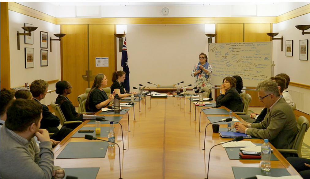
Staff in discussion during Departmental Conversations.