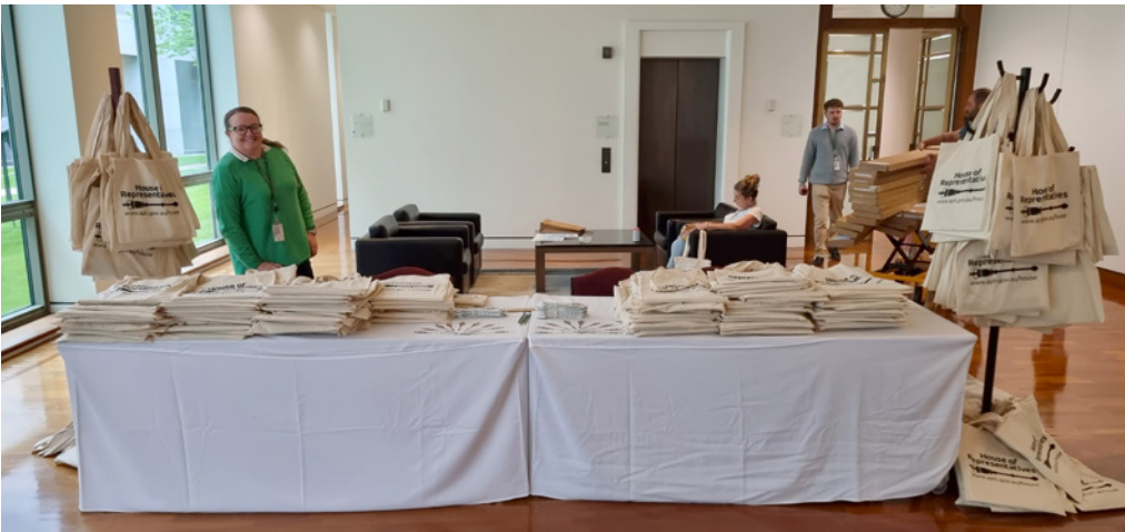
Staff prepare for Parliament House Open Day.