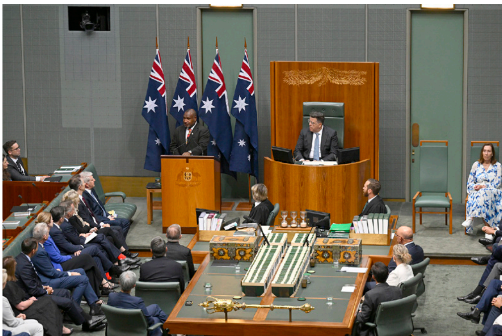
Prime Minister Hon. James Marape, Prime Minister of Papua New Guinea addresses Parliament.