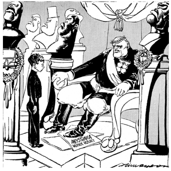
'But, Duce, Can't You Stop the Rains?' State Library of Victoria

'Daddy, what makes the cost of living go up?' 'The cost of dying, my son.'