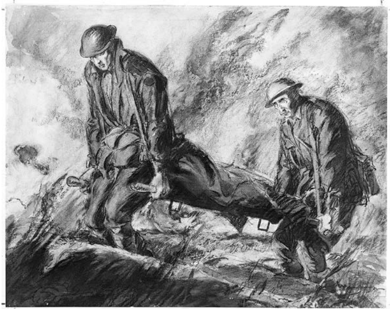
'Stretcher-Bearers Near Butte de Warlencourt' (1917) Australian War Memorial ART02266