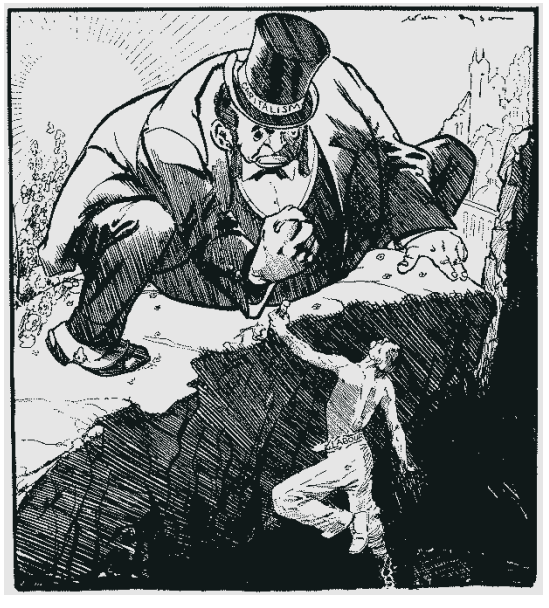
'Labour Wants a "Place in the Sun" ', Cartoons (London, 1913)

One of my favourite Dyson cartoons of this period showed two of these gross rank Fat men together, with one of them saying to the other: 'The visionaries and Socialist