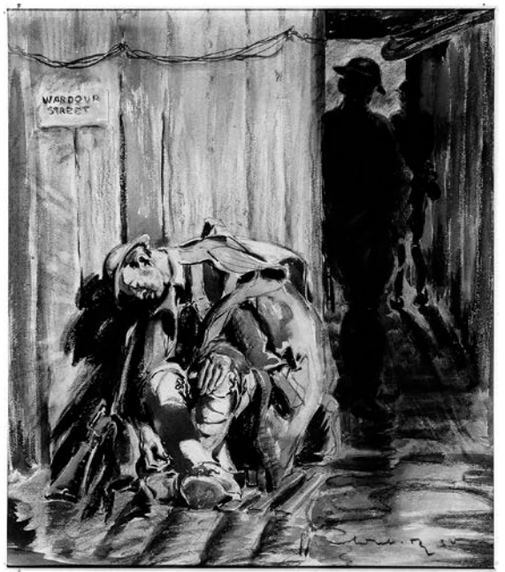
'Dead Beat' (1917) Australian War Memorial ART02210

He was there as we came back ... I have not drawn him as childish as he looked ... He ... had lost himself and floundered all night in shell holes and mud through the awful rain and wind ... He had floundered into the cover of the tunnel and stopped there, disregarded, save for occasional efforts to assist on the part of the men—attempts that could not penetrate through to his consciousness past the dominating instinct to sleep anywhere, anyhow, and at any cost ... he looked so very young—that quality which here has power to touch the heart of older men in the strongest way. To see going into the line boys whose ingenuous faces recall something of your own boyhood—something of someone you stole fruit with, or fought with or wagged it with through long hot Australian afternoons—to see them in this bloody game and to feel that their mother's milk is not yet dry upon their mouths.<sup>20</sup>