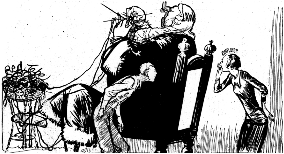
'The Mar-in Law'

There was also a cleverly conceived cartoon about industrial relations. The matronly figure labelled 'Law' knits away at her 'red tape' while the younger female 'Employer' calls to the young male trade unionist: 'Couldn't we get on better together if she were not here?' Dyson's brilliant title is 'The Mar-in-Law'.