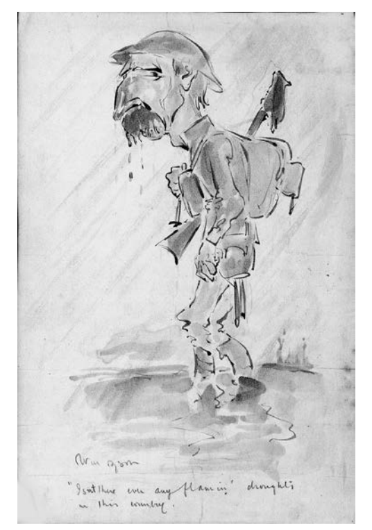
'Isn't there ever any flamin' droughts in this country' (c. 1917–1918)

When a machine-gun officer retrieved a drawing Dyson had left near the front line, Dyson drew for this machine-gunner an impromptu thankyou caricature of a bedraggled wet digger. Although it is a quick black and white sketch, the artist's skill is very evident in the inflamed nose and dripping moustache indicating a heavy cold as this disgruntled digger ploughs through shin-deep mud and slush while rain continues to fall. He is clearly fed up with France in winter. Dyson's caption has him asking 'Isn't there ever any flamin' droughts in this country?'