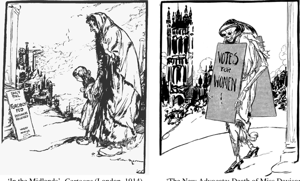
'In the Midlands', Cartoons (London, 1914)

Dyson's cartoons supported impoverished strugglers and militant suffragettes. In one inventive cartoon he combined both these concerns. With arrested suffragettes going on dedicated hunger strikes for their cause, the authorities responded with brutal enforced feeding. Dyson drew a destitute mother and daughter passing a newspaper placard headlining the latest news about this brutal treatment of the suffragettes. Dyson has the impoverished little girl seeing the placard and saying 'Mummy, why don't they forcibly feed us?'