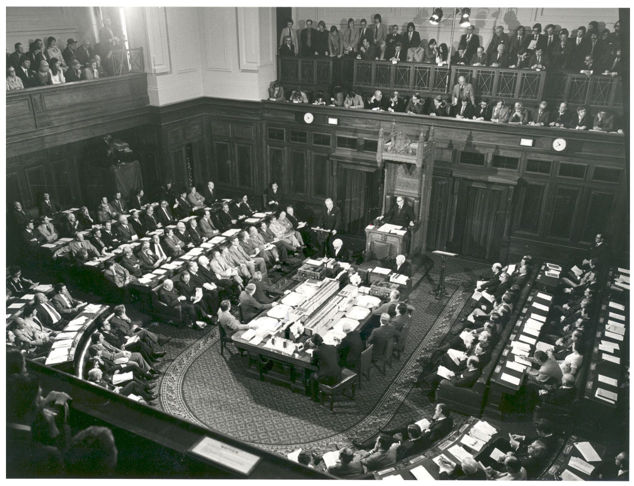
Joint sitting of the houses of the Australian Parliament in August 1974

On three occasions, however, the resulting elections have not been sufficient to resolve the fate of the legislation in dispute. In 1974, the Whitlam Government, although supported by a majority in the House, still lacked support for the disputed legislation in the Senate. As a consequence, a joint sitting was convened. Legislation passed at the joint sitting was subsequently challenged in the High Court and one bill was invalidated because it had not met the conditions of section 57. On the other occasion, in 1987, the bill in contention was abandoned by the government after the election. After the most recent simultaneous dissolution in 2016, the Turnbull Government narrowly retained its majority in the House but lacked a majority in its own right in the Senate. It secured the passage of the disputed legislation after amendments made in the Senate were agreed to by the House.