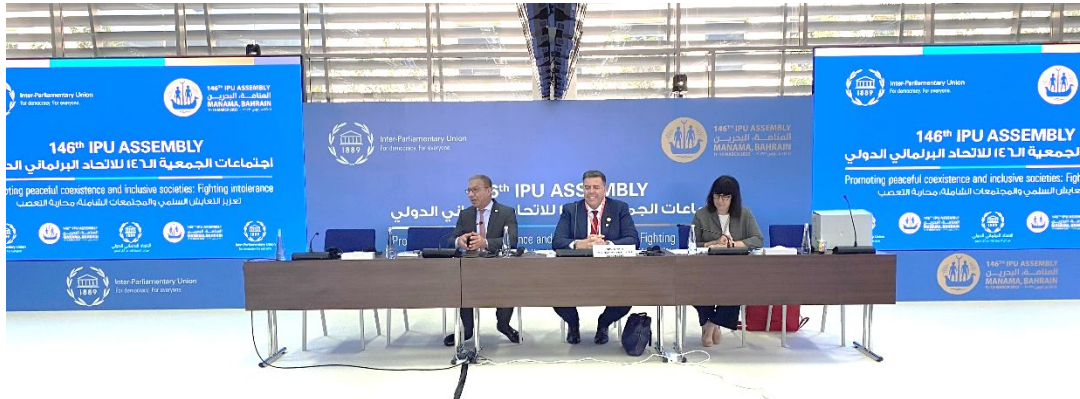
The IPU President addressing the APG meeting chaired by Mr Speaker on 11 March.

The APG also nominated candidates to fill 12 vacancies on seven IPU bodies. These positions were filled with APG-endorsed candidates from nine member country representatives from across the Asia-Pacific region, including Australia with Senator Reynolds endorsed by the APG to fill a vacancy on the Bureau of Women Parliamentarians.