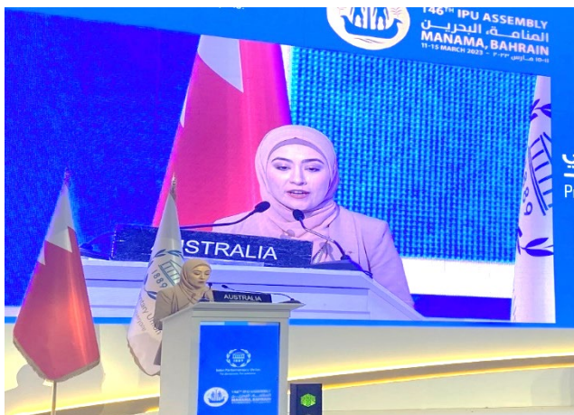
Senator Payman contributing to the general debate on 15 March.

Senator Payman also contributed to the general debate during the session of Young Parliamentarians on 15 March. In her contribution, she emphasised the importance for the Australian Parliament in listening to the views of the more than three million young people in Australia who comprise over 15 per cent of the population. Drawing attention to the diversity of Australia's youth, Senator Payman noted that this diversity makes young Australians uniquely placed to inform government on how to build inclusive societies and address intolerance.