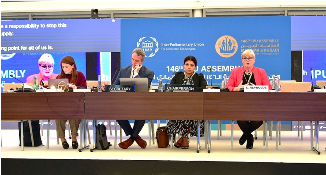
Standing Committee on Democracy and Human Rights Rapporteur to the 147 th Assembly, Senator Reynolds making opening remarks on a proposed resolution on orphanage trafficking.

Noting that orphanage trafficking is a matter of demand and supply, Senator Reynolds indicated that if the demand is cut, the supply will stop. To this end, she explained that the starting point is to educate donors and volunteers that they must do more due diligence and provide guidance on how to be a smarter volunteer and donor. Senator Reynolds concluded by noting that parliamentarians can work together with citizens, governments, and the UN to end this form of trafficking and slavery by changing the behaviour of donors and providing better care and support for vulnerable children and their families.