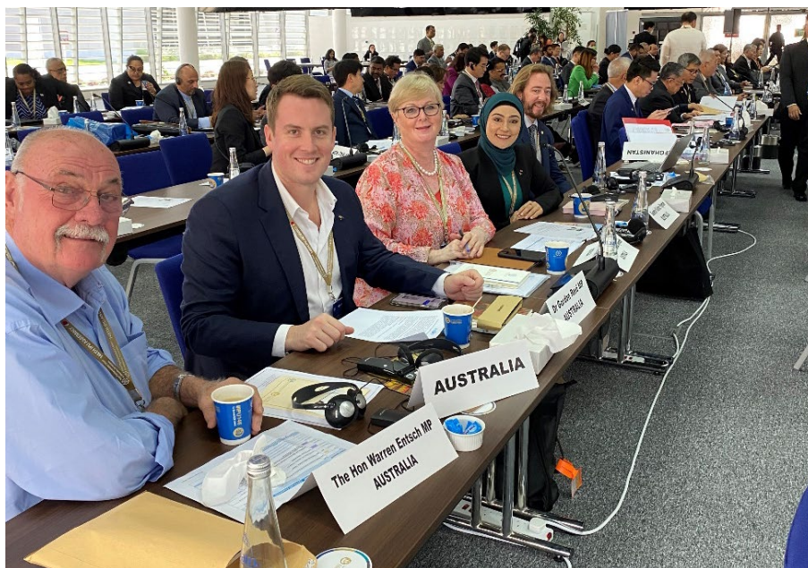
Mr Entsch MP, Dr Reid MP, Senator Reynolds and Senator Payman at the APG meeting.

In his capacity as Chair of the APG, Mr Speaker attended the Joint Meeting of the Chairpersons of Geopolitical Groups and Presidents of Standing Committees on 11 March where he provided an update to the group on the activities of the APG.