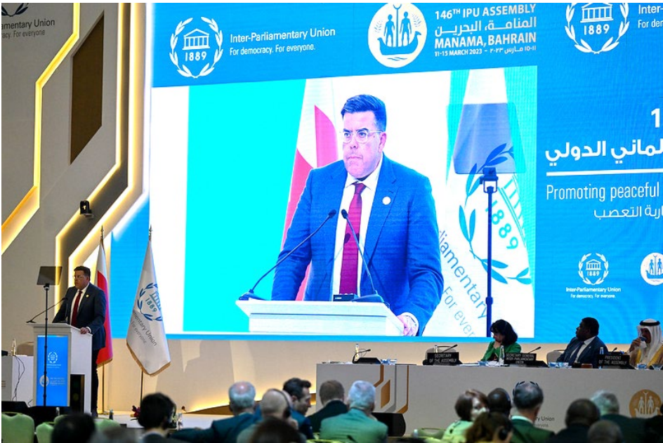
Mr Speaker addressing the General Assembly as Chair of the APG on 15 March.

On 15 March, Mr Speaker presented an update to the General Assembly on the work of the APG in his capacity as APG Chair. In his update, Mr Speaker informed the General Assembly of his intention to work closely with all members of the APG to ensure that they all have an equal opportunity to engage in the IPU Assembly and fully represent the issues and challenges of their peoples and regions. He noted in this regard that with climate change a significant challenge for the region, the participation of the Pacific Islander members of the APG, who face a climate emergency, was more important than ever.