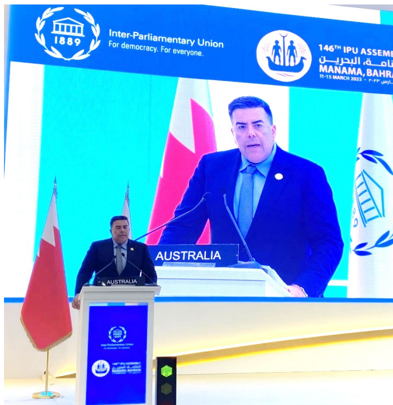
Mr Speaker contributing to the general debate on 13 March.

In his contribution, Mr Speaker drew attention to the high level of support for ethnic diversity and multiculturalism in Australia which gives our society a significant advantage in responding to the pressures placed on social cohesion including intolerance and exclusion, flamed by misinformation and disinformation.