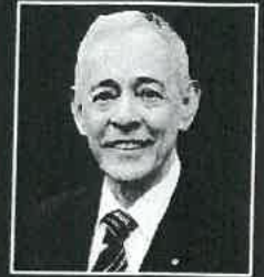
Senator Bob Day AO Senator for South Australia

Parliament House: CANBERRA ACT 2600 Tel (02) 6277 3373 senator.day@aph.gov.au