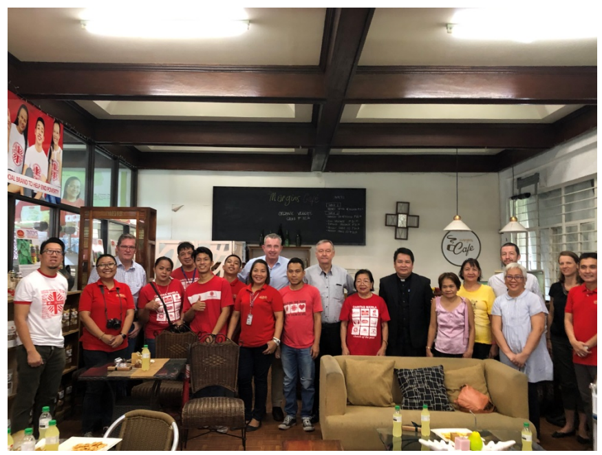
The delegation with volunteers from Margins café.