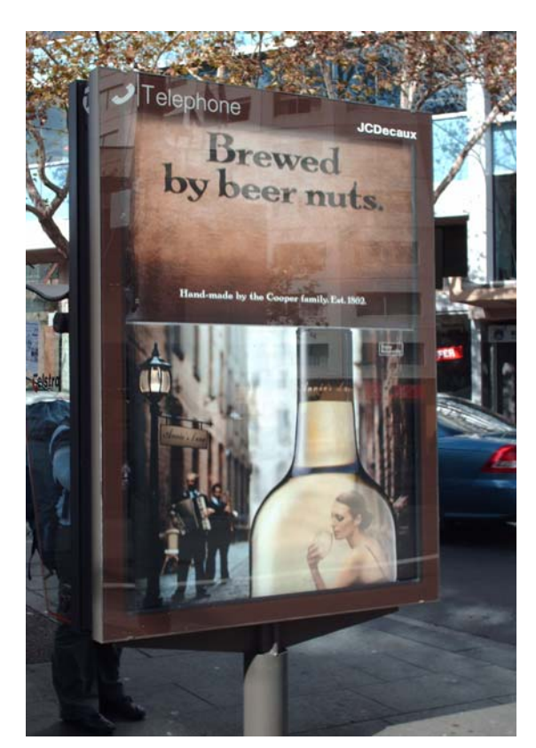
Figures 1-3: Photographs taken of alcohol advertisements identified in the area surrounding primary schools