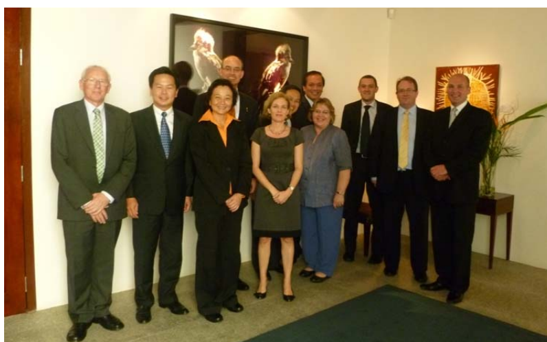
Senate Committee with members of the Singapore-Australia Parliamentary Friendship Group and Australian High Commission officers.

2.45 The committee was also interested to hear the very personal stories of the Singaporean MPs who have had extensive contact with Australia including through studying in Australia; visiting Australia through official Parliamentary delegations or engagement with Australian business.