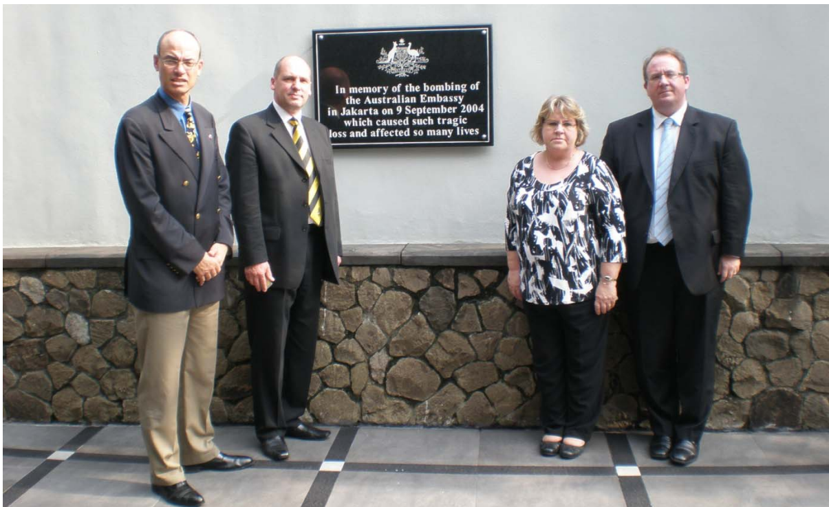
The Senate Committee in front of the memorial for the 9 September 2004 bombing of the Australian Embassy