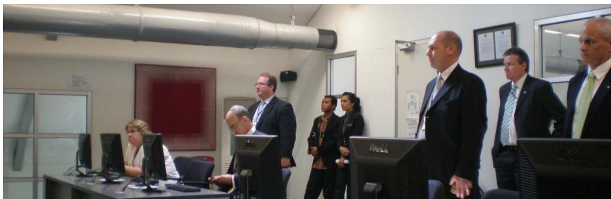
Committee tour and briefing at the Jakarta Centre for Law Enforcement Cooperation

3.47 The committee also had an extensive tour of the JCLEC facilities which included a fully decked out theatre for training; dedicated training rooms with facilities to conduct detailed electronic scenarios; computer based training as well as a commercial style kitchen and living quarters for students.