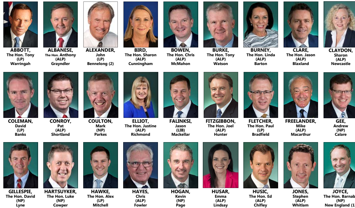
ABBOTT , The Hon. Tony (LP) Warringah ALBANESE , The Hon. Anthony (ALP) Grayndler ALEXANDER , John (ALP) Bennelong (2) BIRD , The Hon. Sharon (ALP) Cunningham BOWEN , The Hon. Chris (ALP) McMahon BURKE , The Hon. Tony (ALP) Watson BURNEY , The Hon. Linda (ALP) Barton CLARE , The Hon. Jason (ALP) Blaxland CLAYDON , Sharon (ALP) Newcastle COLEMAN , David (LP) Banks CONROY , Pat (ALP) Shortland COULTON , Mark (NP) Parkes ELLIOT , The Hon. Justine (ALP) Richmond FALINKSI , Jason (ALP) Mackellar FITZGIBBON , The Hon. Joel (ALP) Hunter FLETCHER , The Hon. Paul (LP) Bradfield FREELANDER , Mike (ALP) Macarthur GEE , Andrew (NP) Calare GILLESPIE , The Hon. David (LP) Lyne HARTSUYKER , The Hon. Luke (NP) Cowper HAWKE , The Hon. Alex (LP) Mitchell HAYES , Chris (ALP) Fowler HOGAN , Kevin (NP) Page HUSAR , Emma (ALP) Lindsay HUSIC , The Hon. Ed (NP) Chifley JONES , Stephen (ALP) Whitlam JOYCE , The Hon. Barnaby (ALP) New England (1) KELLY , Craig (LP) Hughes KELLY , The Hon. Mike (ALP) Eden-Monaro LAUNDY , Craig (LP) Reid LEESER , Julian (LP) Berowra LEY , The Hon. Susan (LP) Farrer McBRIDE , Emma (ALP) Dobell