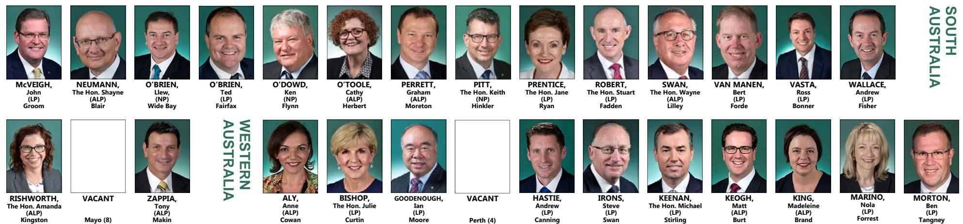
McVEIGH , John (LP) Groom NEUMANN , The Hon. Shayne (ALP) Blair O'BRIEN , Llew. (ALP) Wide Bay O'BRIEN , Ted (ALP) Fairfax O'DOWD , Ken (NP) Flynn O'TOOLE , Cathy (ALP) Herbert PERRETT , Graham (ALP) Moreton PITT , The Hon. Keith (NP) Hinkler PRENTICE , The Hon. Jane (LP) Ryan ROBERT , The Hon. Stuart (LP) Fadden SWAN , The Hon. Wayne (ALP) Lilley VAN MANEN , Bert (LP) Forde VASTA , Ross (LP) Bonner WALLACE , Andrew (LP) Fisher BUTLER , The Hon. Mark (ALP) Port Adelaide CHAMPION , Nick (ALP) Wakefield ELLIS , Nola (ALP) Adelaide FLINT , Nicolle (LP) Boothby GEORGANAS , Steve (ALP) Hindmarsh PASIN , Tony (LP) Barker PYNE , The Hon. Christopher (LP) Sturt RAMSEY , Rowan (LP) Grey RISHWORTH , The Hon. Amanda (ALP) Kingston VACANT , Mayo (8) ZAPPIA , Tony (ALP) Makin ALY , Anne (ALP) Cowan BISHOP , The Hon. Julie (ALP) Curtin GOODENOUGH , Ian (LP) Moore VACANT , Perth (4) HASTIE , Andrew (LP) Canning IRONS , Steve (LP) Swan KEENAN , The Hon. Michael (ALP) Stirling KEOGH , Matt (ALP) Burt KING , Madeleine (LP) Brand MARINO , Matt (LP) Forrest MORTON , Ben (LP) Tangney PORTER , The Hon. Christian (ALP) Pearce PRICE , Melissa (LP) Durack VACANT , Fremantle (5) WILSON , Rick (ALP) O'Connor WYATT , The Hon. Ken (LP) Hasluck COLLINS , The Hon. Julie (ALP) Franklin HART , Ross (ALP) Bass