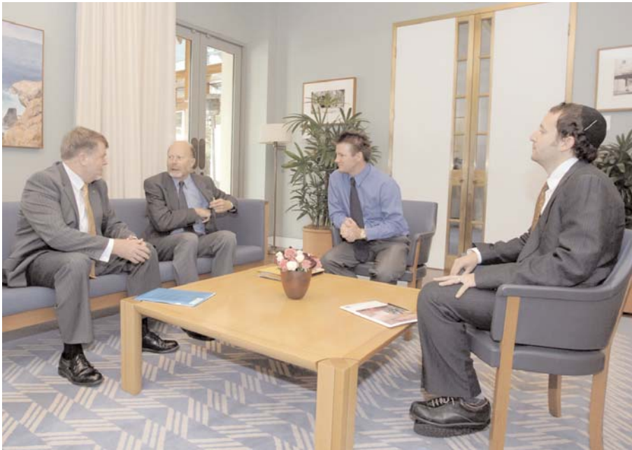
The Speaker receives members from the Federation of Australian Scientific & Technological Societies