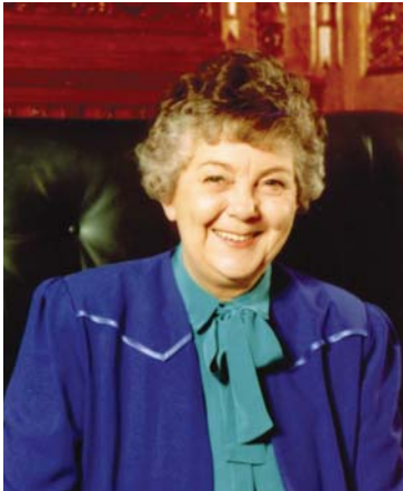
Hon. Joan Child AO [1921– ] Speaker: 1986– 1989

Gloria Joan Liles Child (known as Joan Child) was the first female Speaker of the House, having been elected to the position in 1986 after Speaker Dr Harry Jenkins resigned from Parliament because of ill health. She was the last Speaker in the “Temporary” Parliament House that had been the home of the Federal Parliament for almost 60 years and the first Speaker in the “new and permanent” House