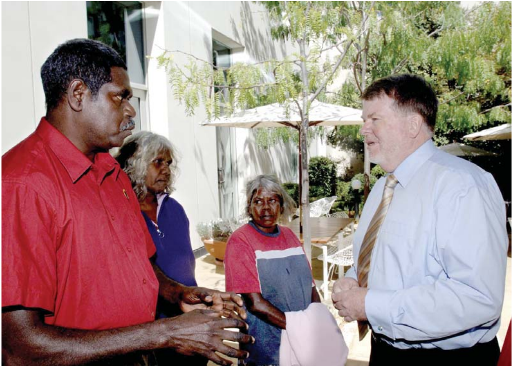
The Speaker meets informally with visitors from the Wadeye Indigenous community.