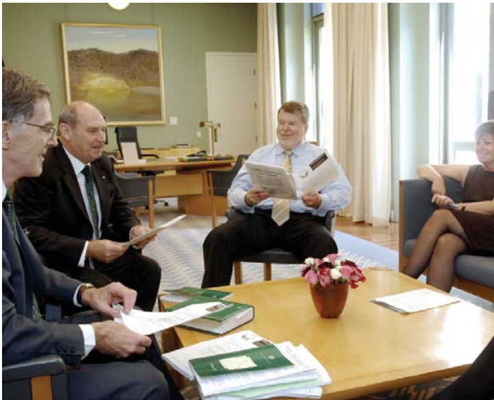
Before each sitting commences the Speaker and Deputy Speaker meet informally with the Clerks to discuss the program