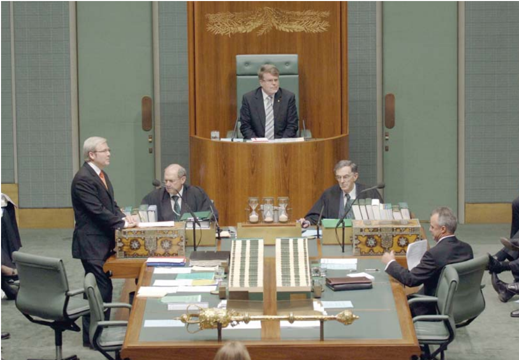
The Speaker presiding over question time

The Speaker calls upon Members to speak in debates or to ask questions during question time. In doing so he or she seeks to share the opportunities evenly between the government and non-government Members. The Speaker also makes sure that backbenchers are not overlooked, despite the greater responsibilities of Ministers and opposition frontbenchers. An important part of the Speaker's task is to protect the rights of individuals and minorities in the House and make sure that everyone is treated fairly within the framework set by the rules.