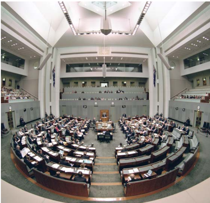
The Chamber of the House of Representatives

When Britain established the Australian colonies during the 18th and 19th centuries, the system of parliamentary government of the home country was one of many institutions which were successfully transplanted. Like other transplants, it has developed independently while continuing to express its origins.