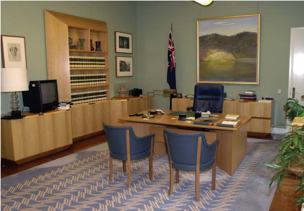
The Speaker's office