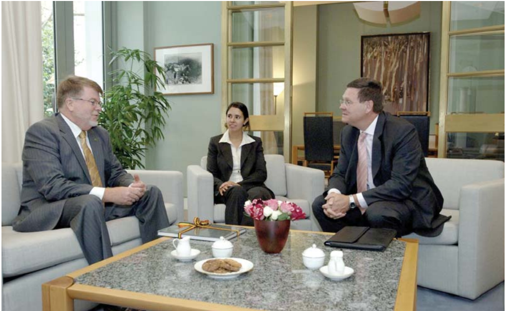
Speaker meeting with the Belgian Ambassador