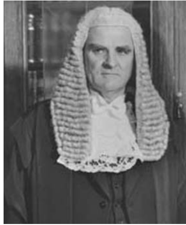
Hon. Archie Cameron [1895–1956] Speaker: 1950–1956

Inspired by a lofty conception of the duties of his office, he presided over the House of Representatives with conspicuous ability, firmness, and impartiality. An unsparing devotion to administrative duties was associated with a personal courtesy which endeared him to members and officers of the House.