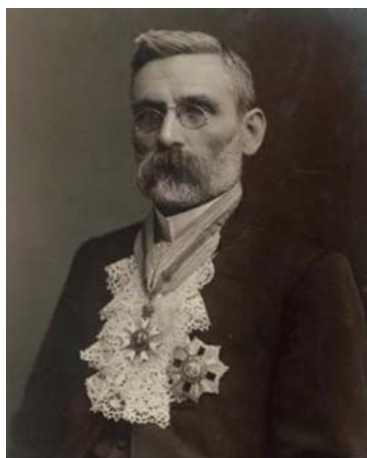
Hon. Sir Frederick William Holder KCMG [1850–1909] Speaker: 1901–1909

There have been many colourful Speakers during the 107 years of the House of Representatives. A complete list is at appendix A. The following longer notes on a number of well known occupants of the Chair provide a glimpse of the history of the institution of the House Speaker.