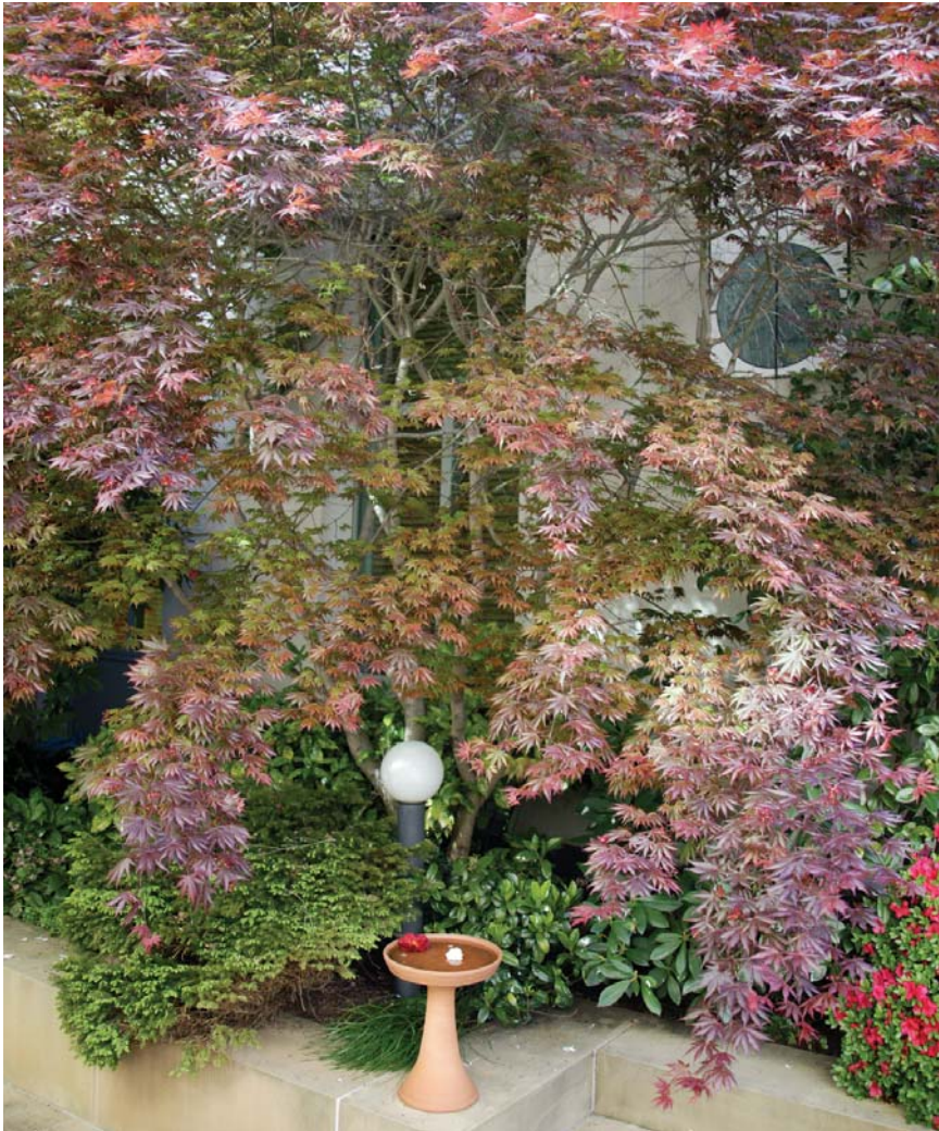
The Speaker's courtyard