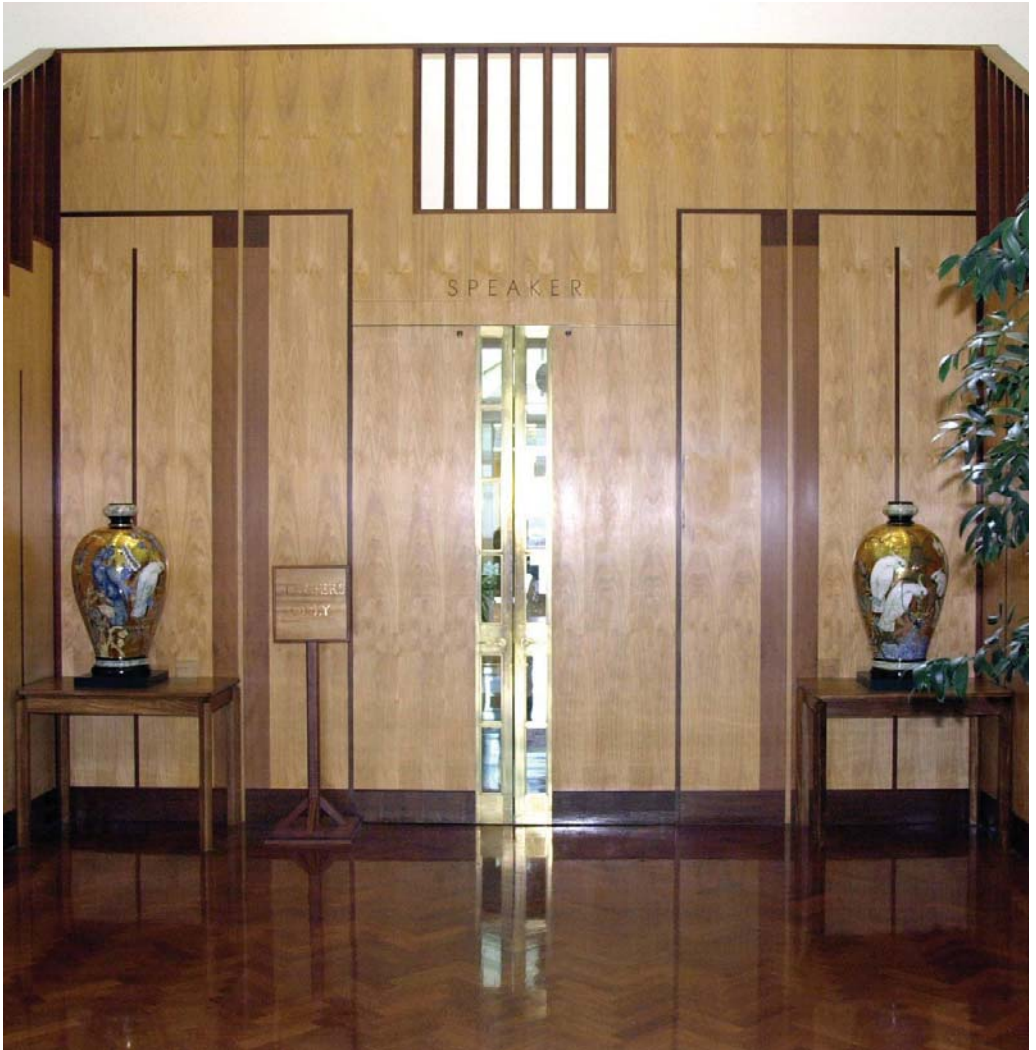
Entrance to the Speaker's Suite House of Representatives Parliament House