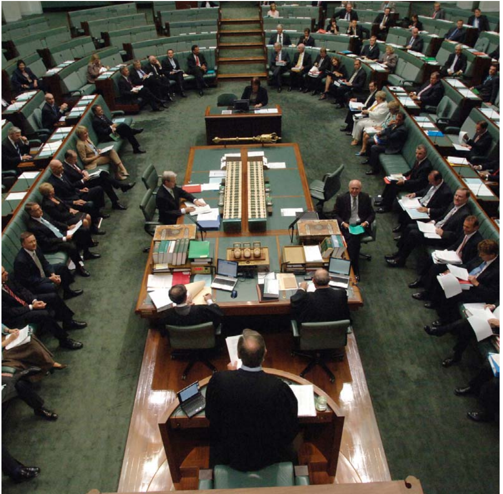
Layout of the Chamber from the Speaker's perspective

The Speaker supervises rather than participates in proceedings. He or she makes statements or announcements to the House as necessary, but does not normally take part in debate and does not vote in the House except when numbers are equal, in which case the Speaker has a casting vote.