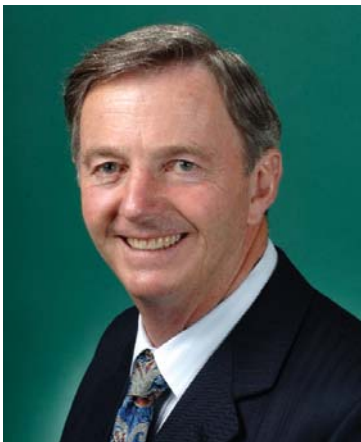
Hon David Hawker [1949–] Speaker: 2004–2008