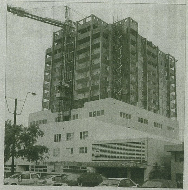
Going up, up and up: Body corporate insurance premiums have gone up by 300 per cent in some cases Experts say homeowners would also pay more for insurance after worldwide natural disasters.

matter for insurers. "Insurers base their premi-ums on risk," he said.