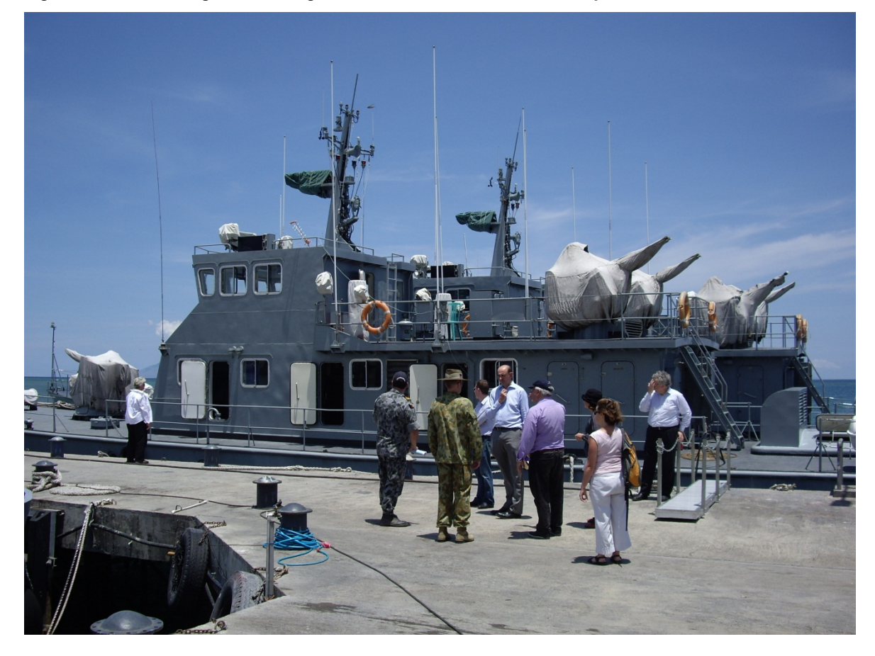
Figure 2.1 The delegation visiting Timor-Leste's naval facilities and patrol boats at Port Hera

2.40 Development assistance is delivered under a Strategic Planning Agreement for Development between the Government of Timor-Leste and the Government of Australia (2011) and is based on priorities and targets identified by the Government of Timor-Leste in its Strategic Development Plan 2012–2030.