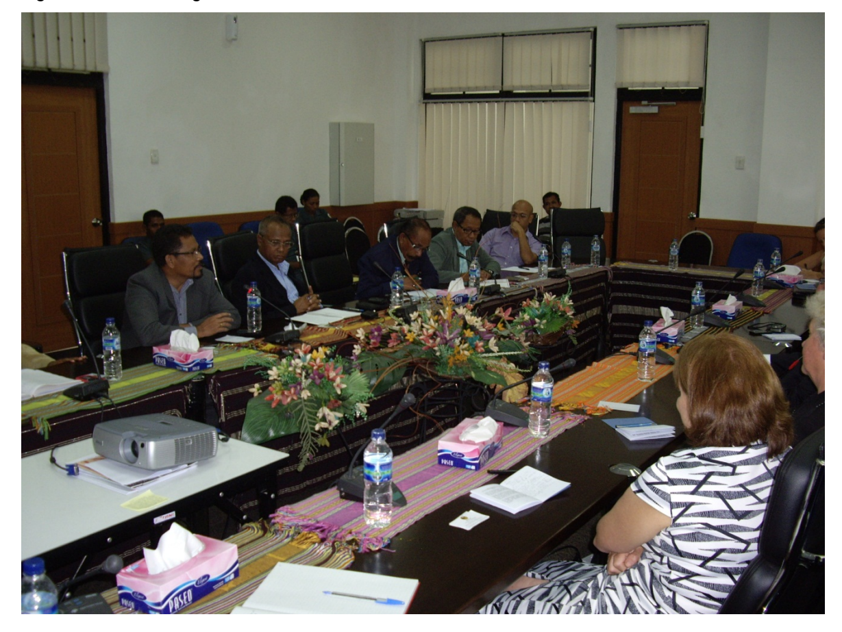
Figure 2.6 The delegation in discussion with members of Commission B of the National Parliament

fishing in Timorese waters. He noted that an agreement is in place with Indonesia for maritime security arrangements and progress has also been made concerning the land border.