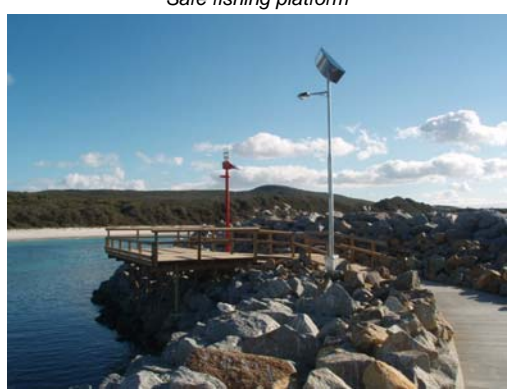
Safe fishing platform with solar-powered night lighting