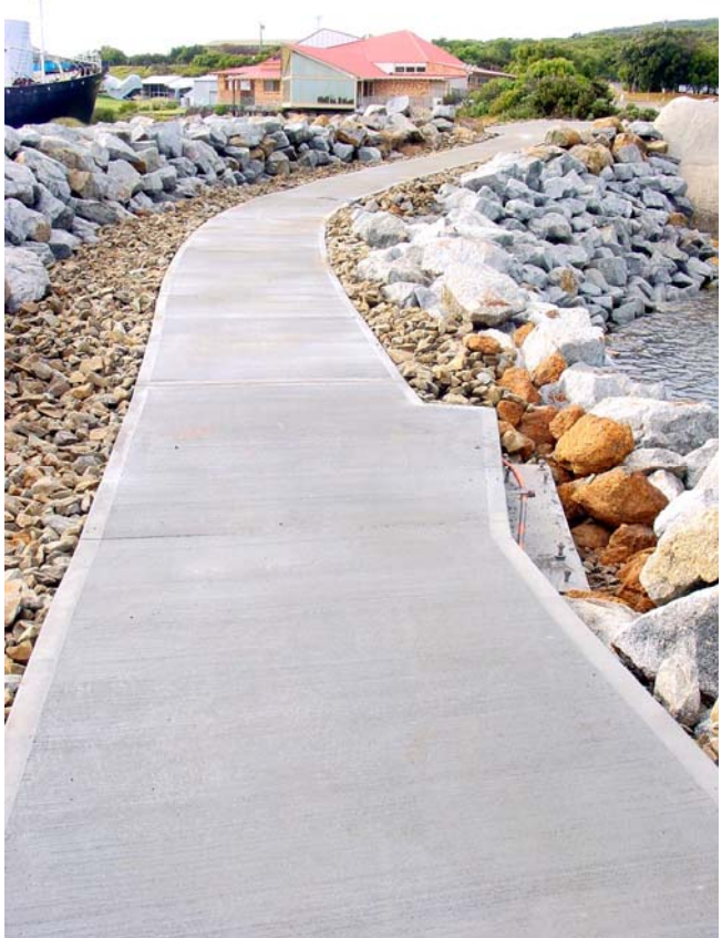
CONCRETE PATHWAY COMPLETED 16/2/06