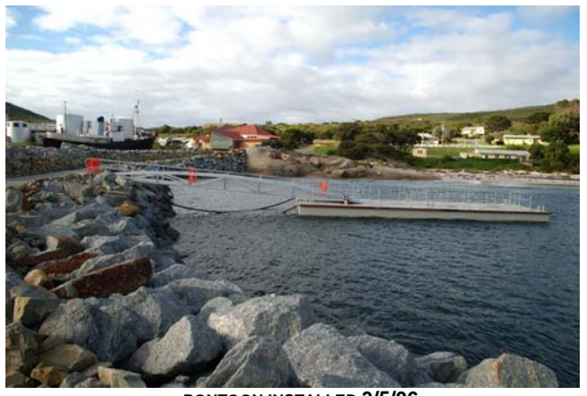
PONTOON INSTALLED 3/5/06