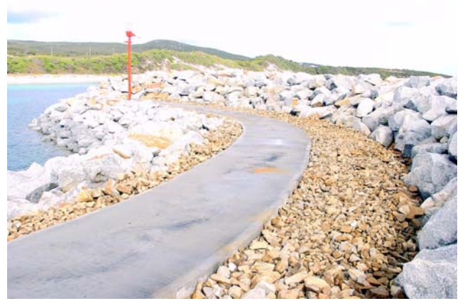
NAVIGATION BEACON AND PATH 16/2/06