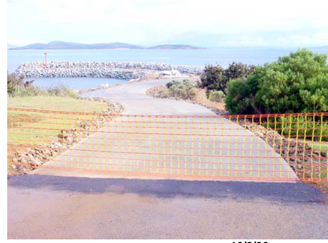
NAVIGATION BEACON AND PATH 16/2/06