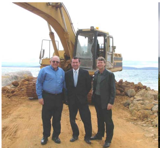
TOURISM MINISTER MARK MCGOWAN (CENTRE) VISIT 5/9/05 PETER SNOW (JCF) (LEFT) & NEIL AUGUSTSON (TOURISM WA)