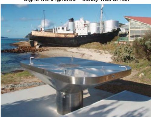
Fishing cleaning facilities