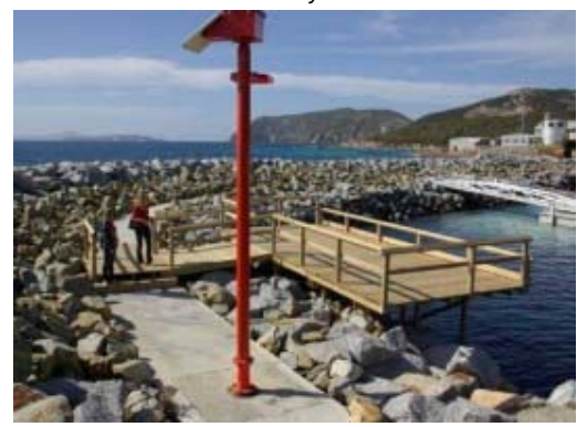
Safe fishing platform