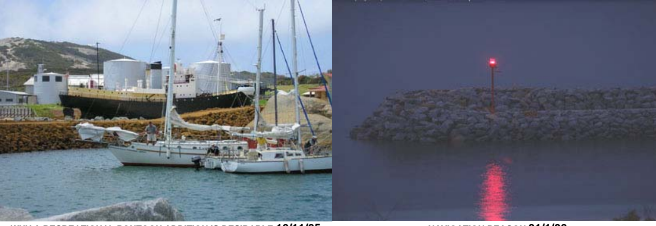
WHY A RECREATIONAL PONTOON ADDITION IS DESIRABLE 16/11/05