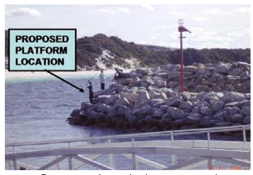
Pre-construction – why there was a need