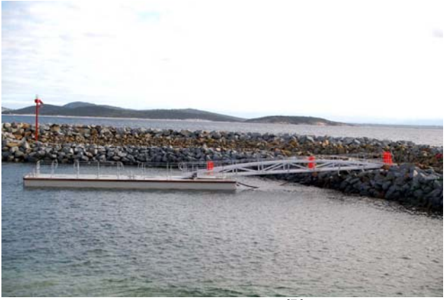
PONTOON INSTALLED 3/5/06