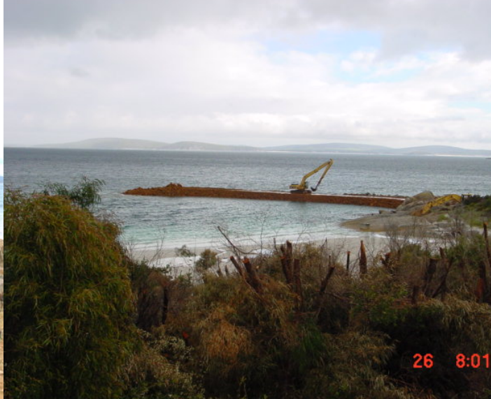
BREAKWATER UNDER CONSTRUCTION 26/10/05