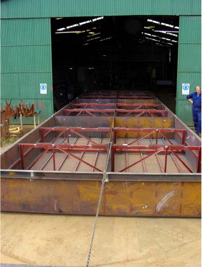
PONTOON UNDER CONSTRUCTION 15/2/06