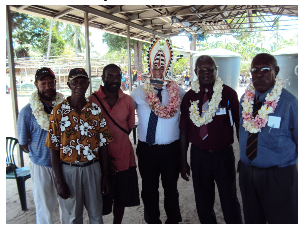
Delegation Chair in mask presented at Mabadawan. AusAID watertanks in background

3.112 As previously noted, Western Province is Australia's closest neighbour. At their closest point, Sigabadaru is a mere 15 minute boat ride away from