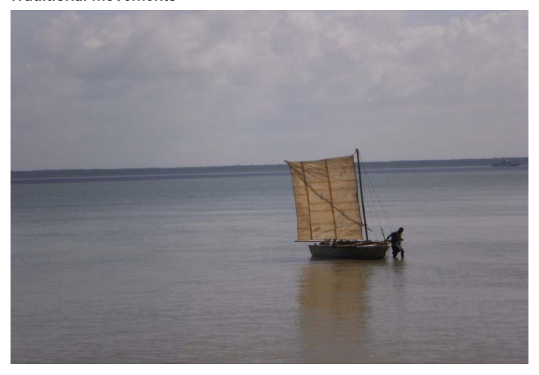
A PNG treaty villager coming ashore Saibai Island