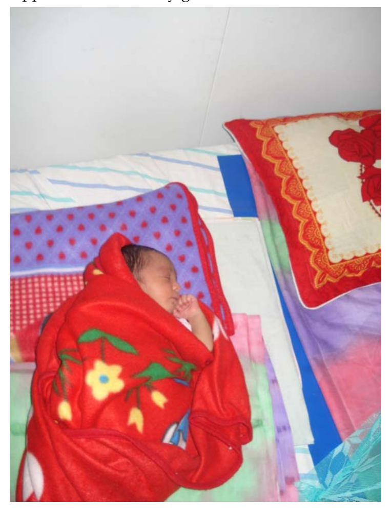
Newborn baby in health clinic

4.112 Delegates thought that the centre was light, bright and airy and were delighted to be introduced to some newborn babies and mothers who appeared to be in very good health.