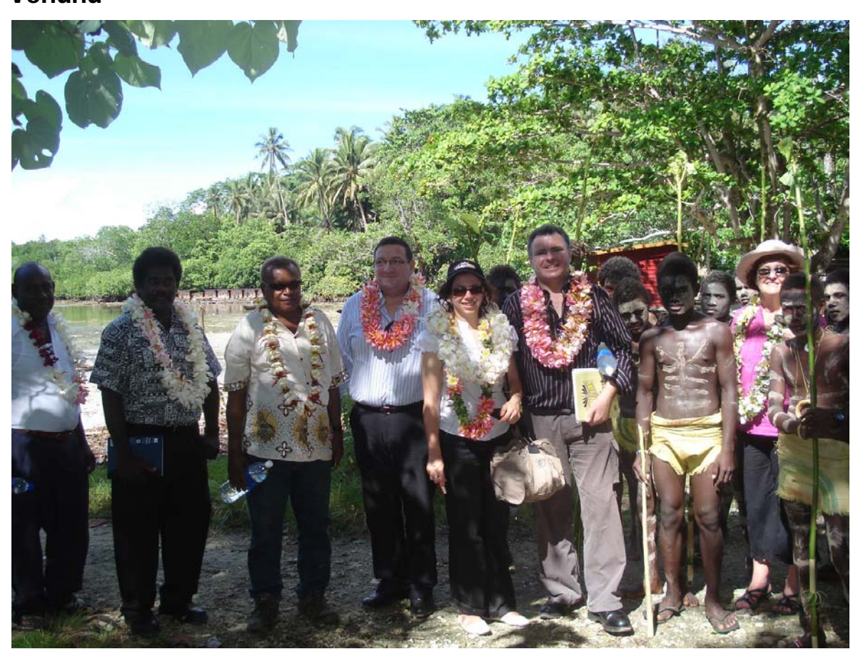
Community welcome on Vonunu