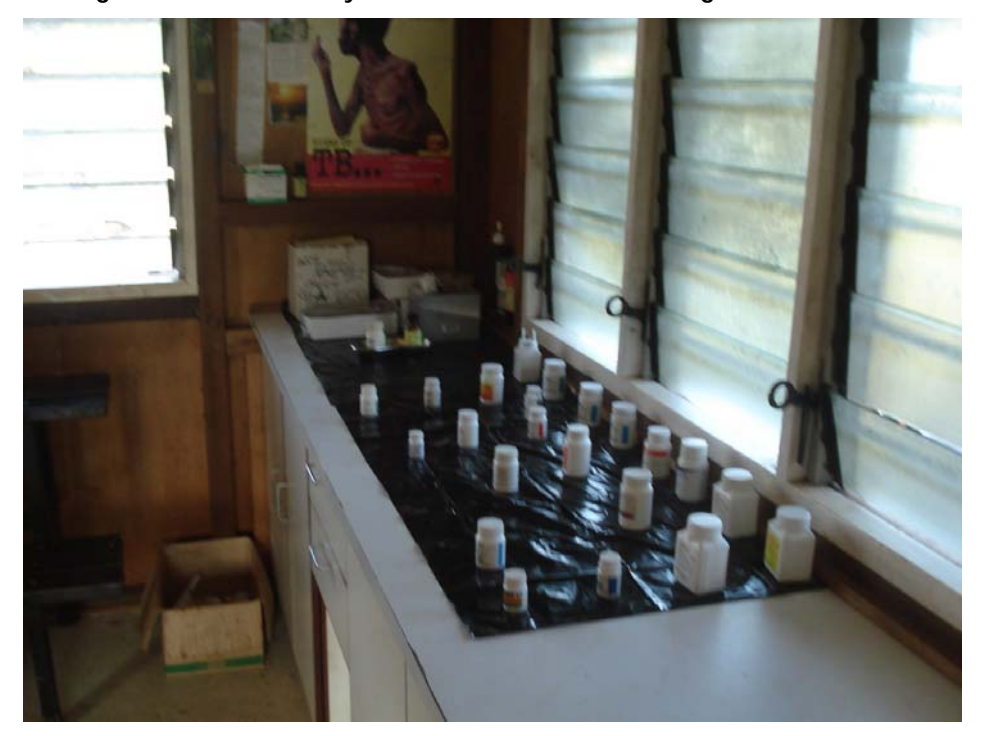
Drugs on display at Buzi aid post

3.121 The delegation saw that health facilities and services are basic in the villages. At Mabadawan, the clinic building was indeed deteriorating and in need of upgrade, beds had no mattresses and equipment was sparse. Staff said access to drugs and sterile equipment was another issue (with drugs having to make their way from the central store in Port Moresby to