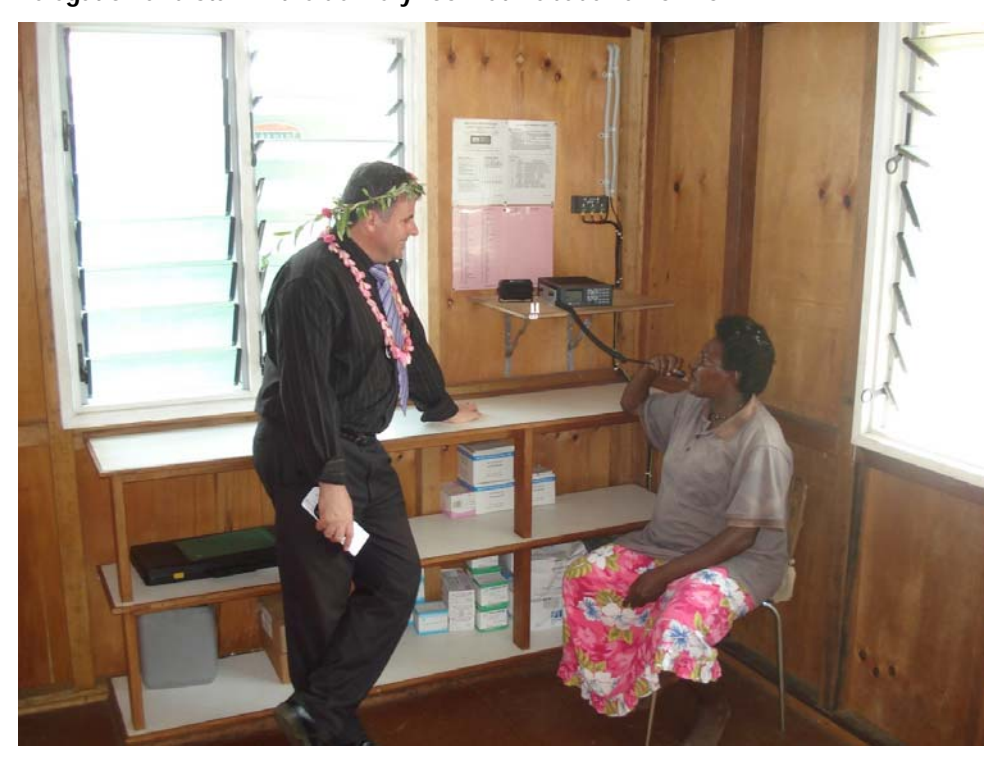
Delegate and local at the Sigabadaru community aid post radio room