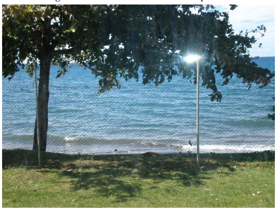
View of ocean from National Referral Hospital window, only metres away