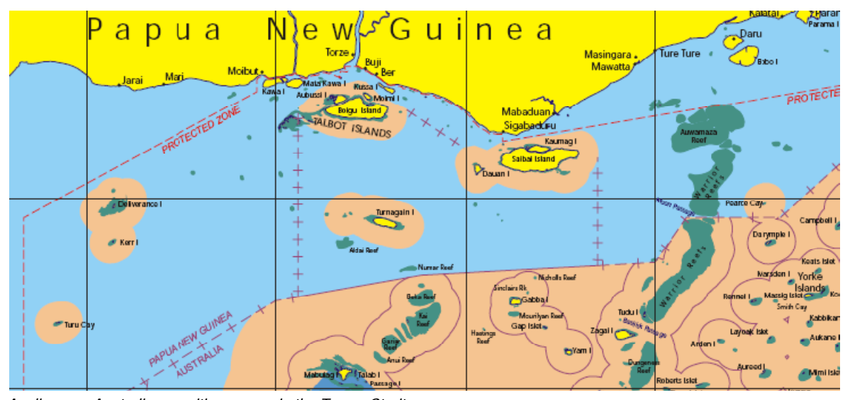
Auslig map, Australia's maritime zones in the Torres Strait

Map of treaty villages in Western Province