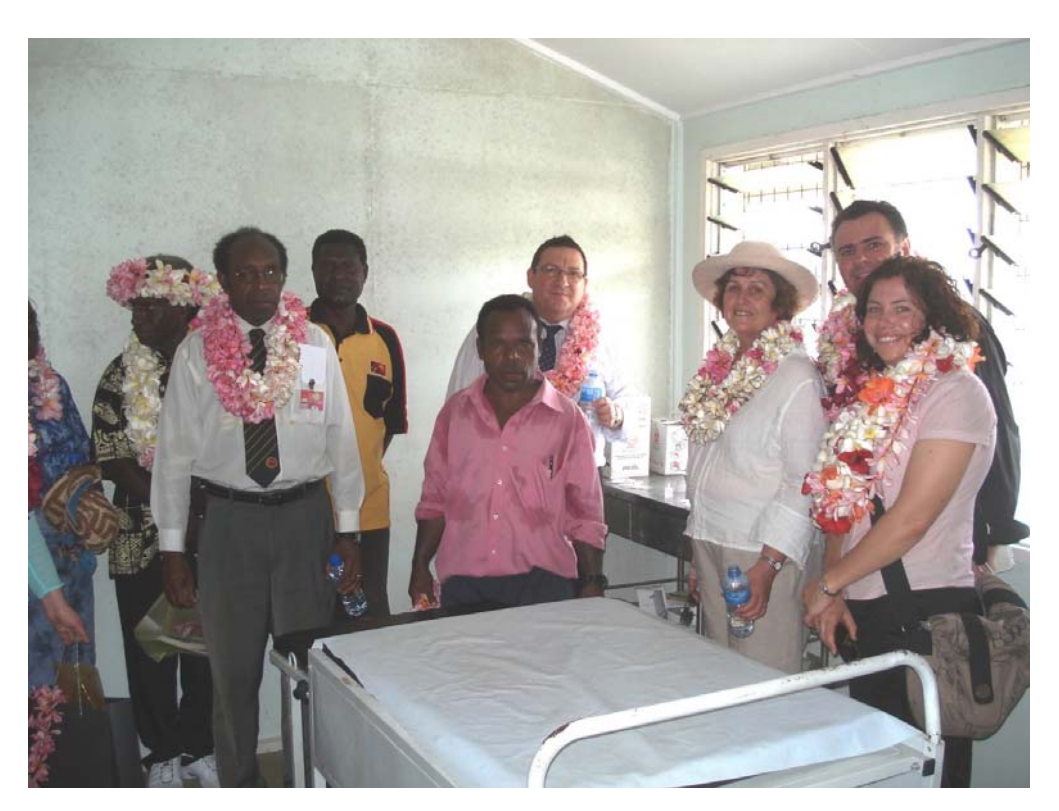
Delegation and staff in the delivery room at Mabadawan clinic

community aid posts which serve smaller populations at Sigabadaru (approximately 250) and Buzi (roughly 150).