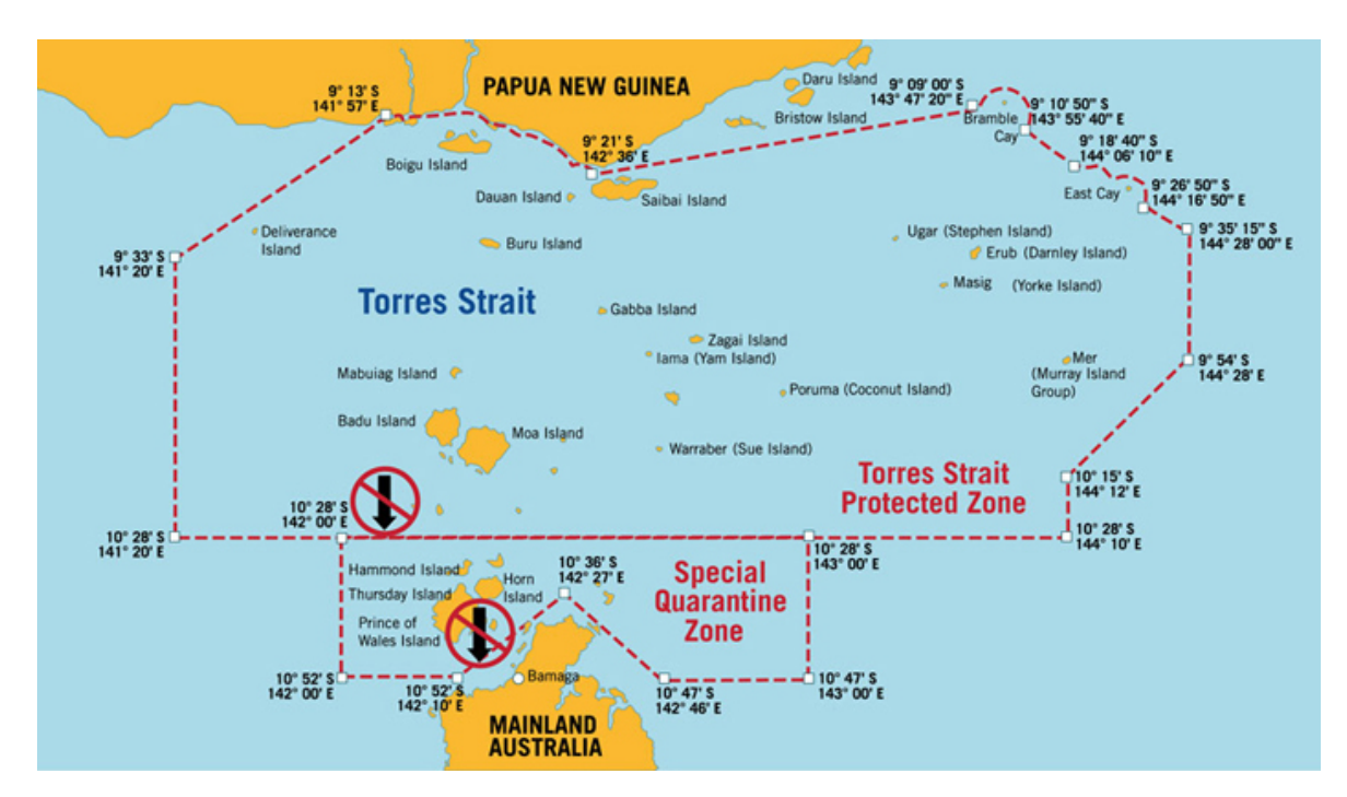
Figure 1.0 Map of Torres Strait Treaty Area