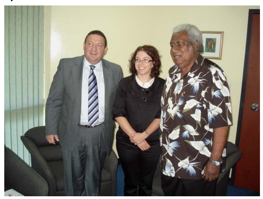
The Delegation Chair and Chair of the Australian Parliament Pacific Friendship Group with the Speaker of the Solomon Islands Parliament