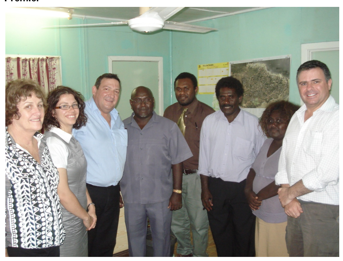
The delegation, Western Province Premier, Acting Health Director and Health Minister

4.97 The delegation appreciated the opportunity to meet with the Western Province Premier and the provincial Ministers for Health and Education,