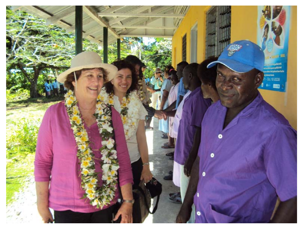
Delegates being greeted by staff at Vonunu health clinic