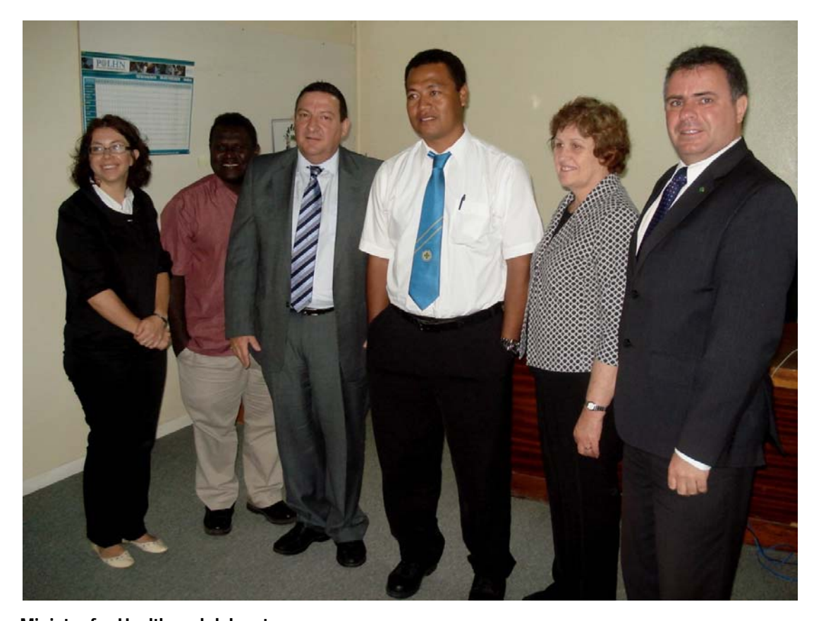
Minister for Health and delegates