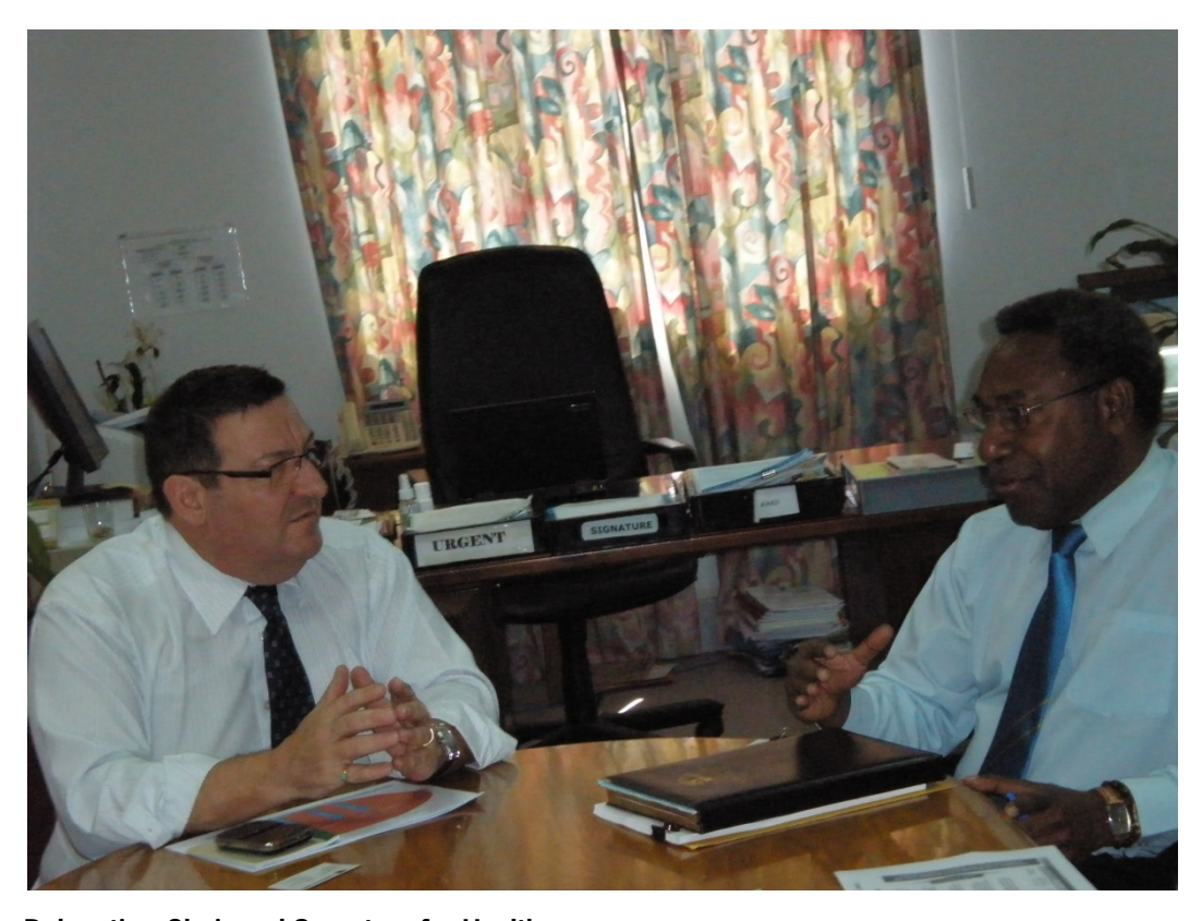
Delegation Chair and Secretary for Health