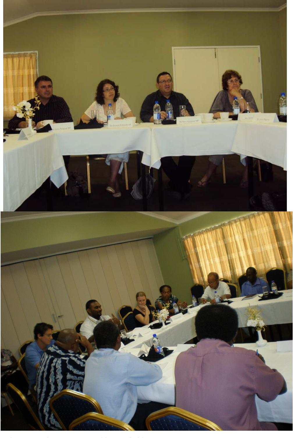
Delegates and Ministry of Health roundtable participants