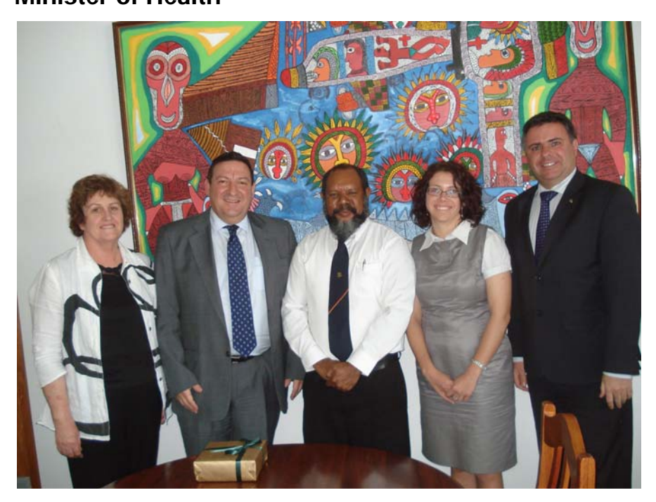
The Minister for Health, the Hon. Sasa Zibe MP, and committee delegates