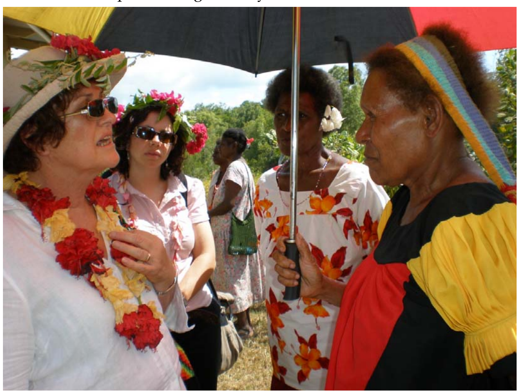
Delegates and women leaders at Sigabadaru

Daru, and then onward to the villages by boat). Villagers called for more doctors and nurses, a routine outreach service from Daru and speedier referrals, to minimise patients accessing the clinic on Saibai. Other issues brought to the delegation's attention included a shortage of housing for health workers; maintenance delays in fixing broken bore pumps; and outstanding compensation claims for ex-pearl divers who had worked in the Australian pearl diving industry.