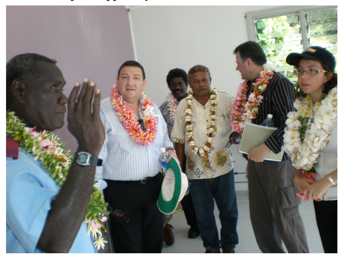
Health staff showing delegates around the clinic