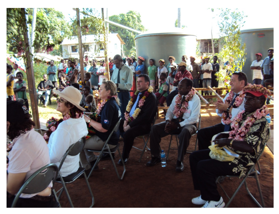
Meeting with Buzi community - AusAID water tanks in background