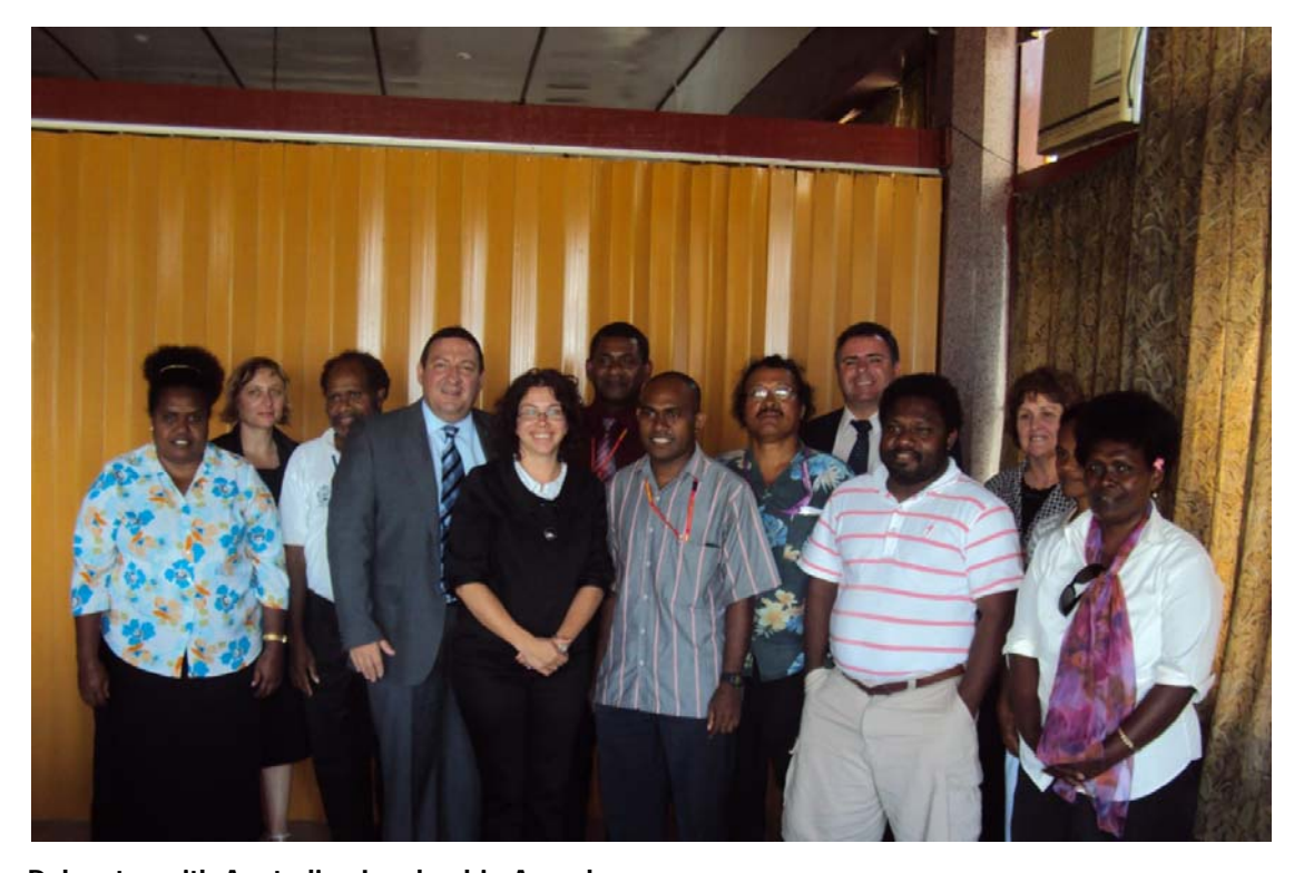
Delegates with Australian Leadership Awardees