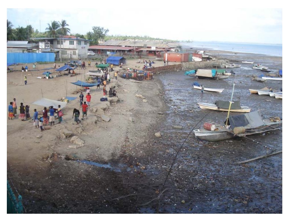
Daru foreshore, local markets and boats on which people live