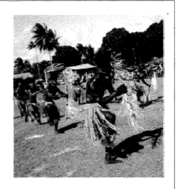
WELCOME: Traditional greeting for the Health Committee.

The committee expects to table its report on the visit in early 2010. ■