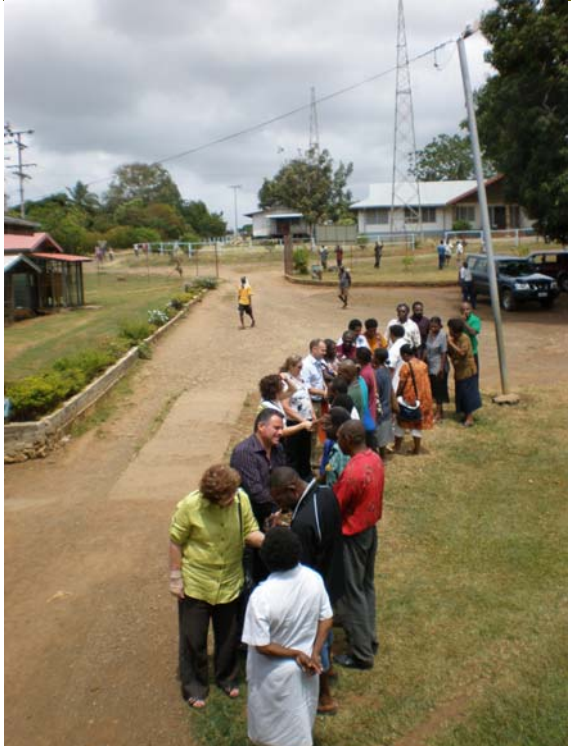
Daru hospital staff greeting the delegation