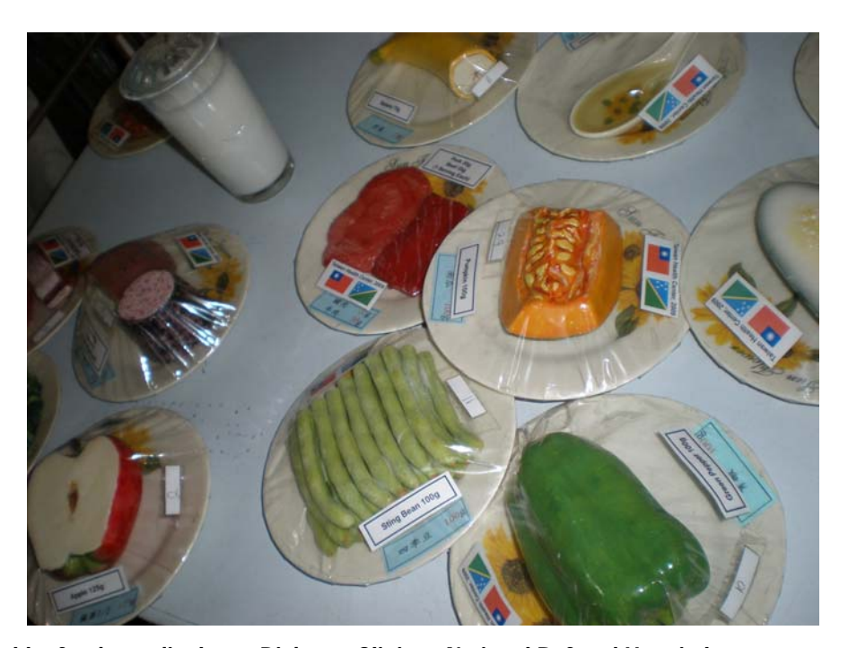
Healthy foods on display at Diabetes Clinic at National Referral Hospital

The Committee recommends that the Australian government support education programs about diabetes prevention and nutrition in the Torres Strait, the Solomon Islands and Papua New Guinea, in areas where diabetes and nutrition are problematic.