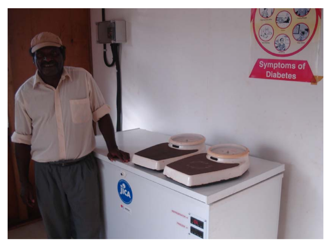
Solar fridge installed at Buzi

recent installation of a solar refrigerator to store vaccines (with funding provided by the Western Province Health Office).<sup>43</sup>