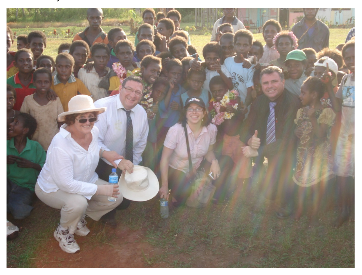
Delegates and children in Sigabadaru

The Committee recommends that any new health facility that the Australian government helps construct should provide for staff accommodation and ongoing maintenance, in consultation and partnership with the local community.