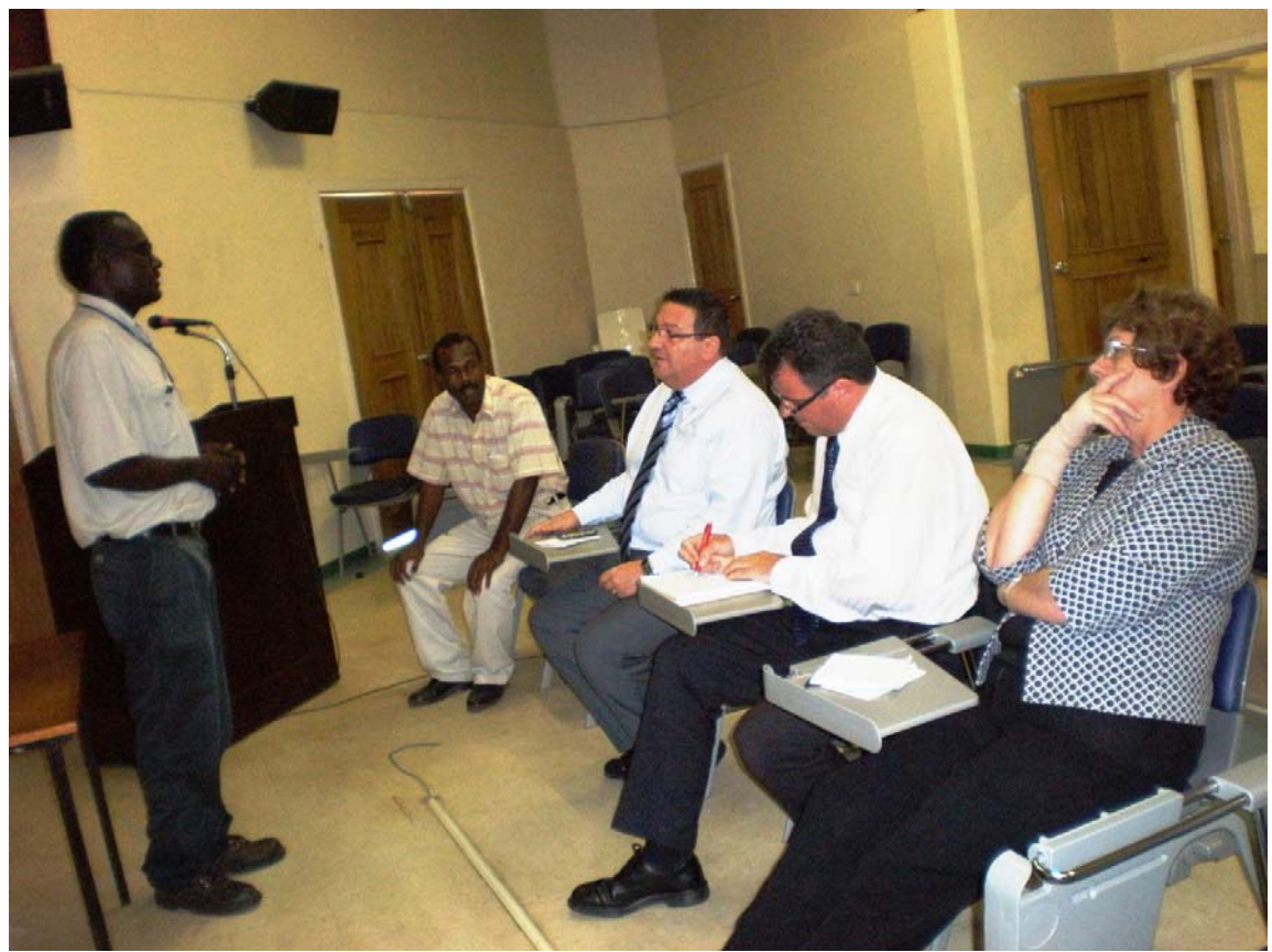
Medical Superintendent (standing), NRH CEO (seated, second left) and delegates