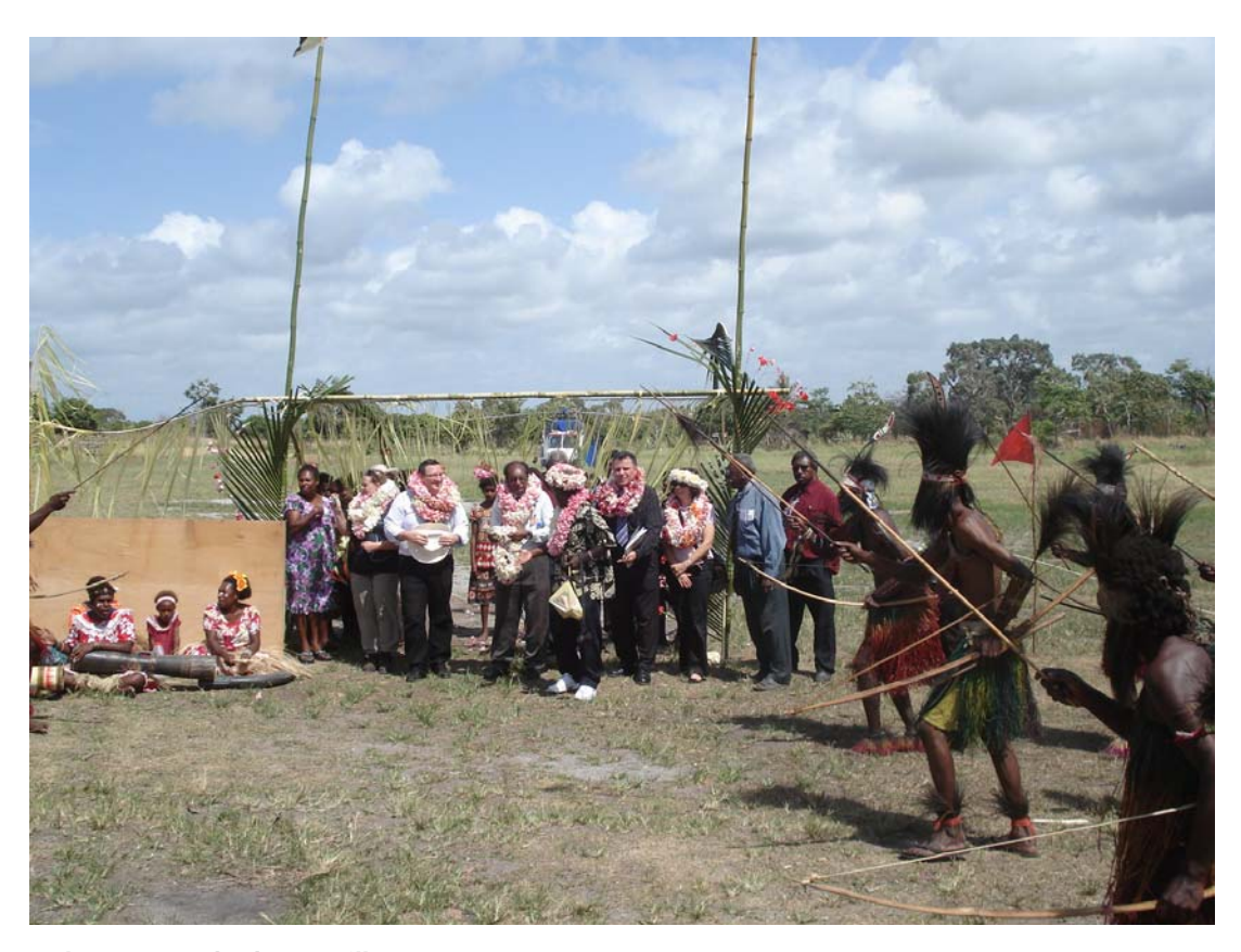
Welcome at Mabadawan village