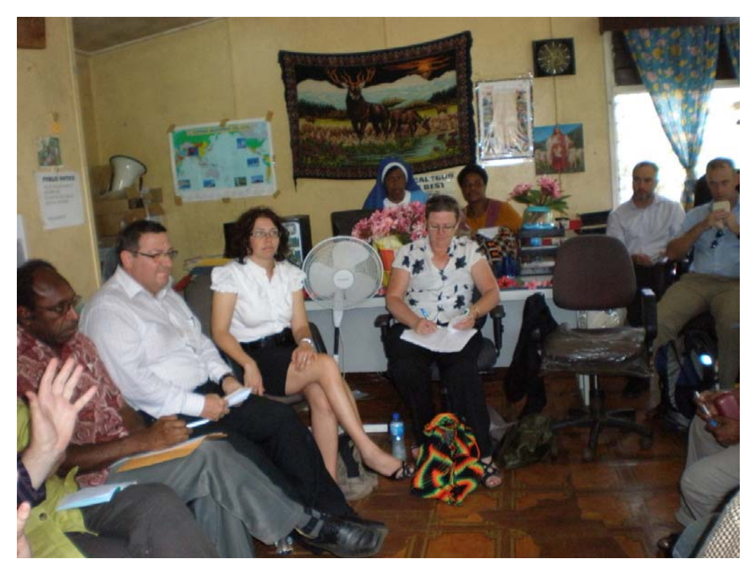
Delegates and health representatives at Western Province Health Office