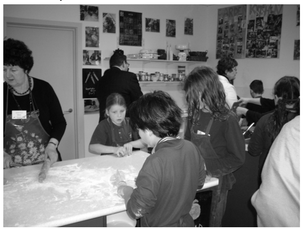
Figure 5.2 Cooking as part of the Stephanie Alexander Kitchen Garden Project at Westgarth Primary School, Melbourne, Victoria

Program in action at Westgarth Primary School in Melbourne on 20 June 2008. Students, teachers and volunteers shared some endearing stories that illustrate how children can have as much influence on their parents as their parents have on them. Students are helping at home to prepare meals, set the table and clear up afterwards. They contribute ideas for meals and want to know why their parents aren't buying and using different ingredients. One girl asked her mother, 'Why don't we have sage growing at home?' Another boy told the Members, 'I live with my dad and he used to cook everything out of packets and tins. I've shown him how to cook proper food. We go shopping and buy fruit and vegies and proper stuff.'