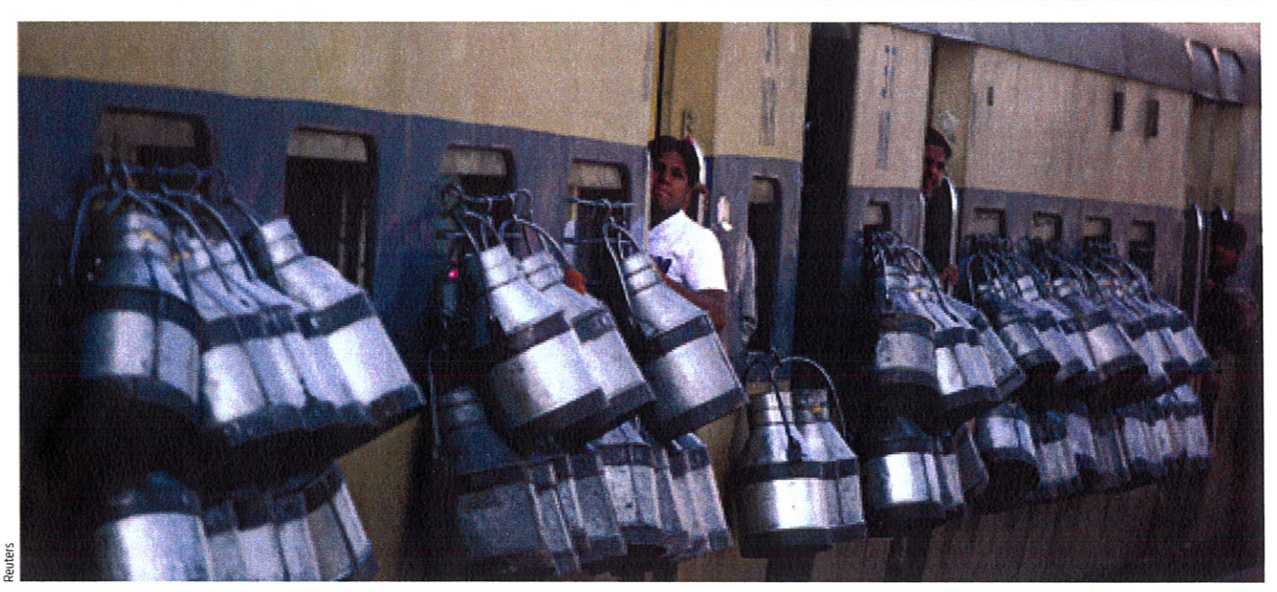
Milk containers hang from the windows of a passenger train in Ghaziabad on the outskirts of New Delhi, India, last month. According to a survey by India's food safety authority earlier this year, most of the country's milk is diluted, or tainted with products such as bleach and detergent. The survey reportedly found that 70% of samples in urban areas and 30% in rural areas were contaminated.