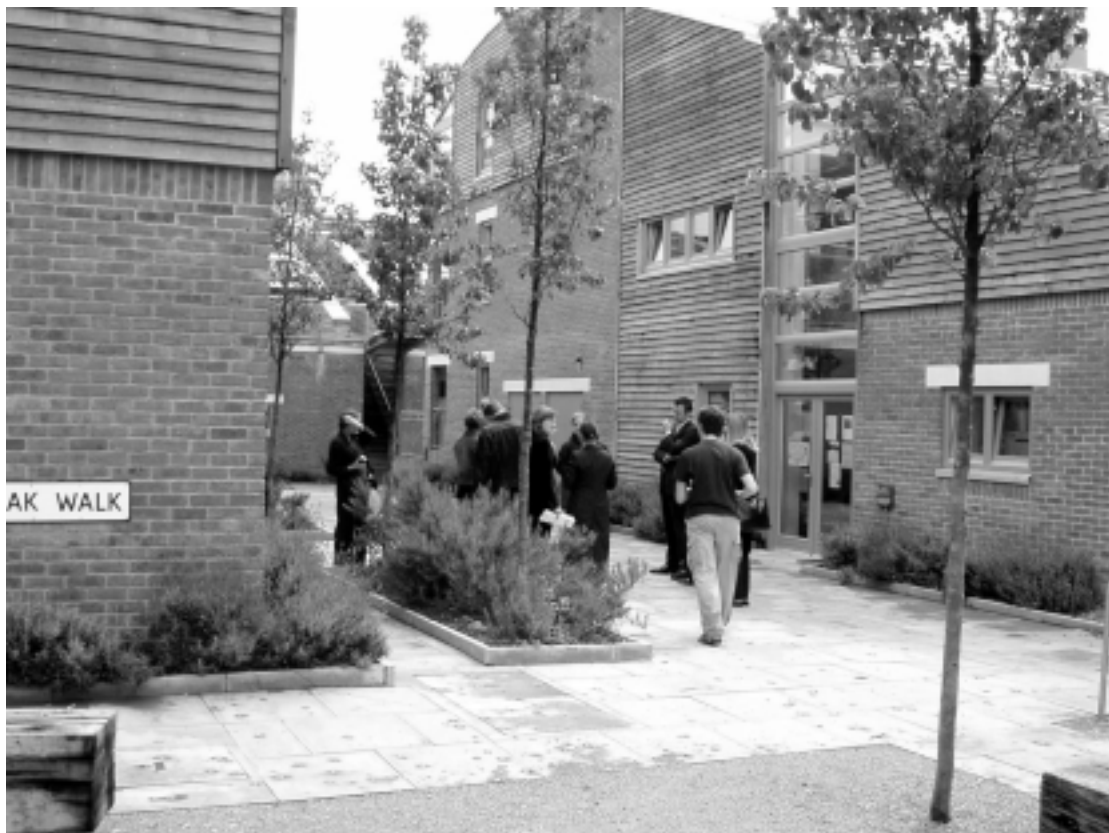
Figure 2. Beddington Zero Fossil Fuel Emission Development (BedZed) in the London Borough of Sutton.

BedZed (Figure 2) was jointly designed by the environmental consultant, Bioregional, and the architect Bill Dunster for The Peabody Trust, one of the largest and oldest non-profit organizations in Britain providing affordable housing 3 . BedZed is a medium density development consisting of 82 flats and houses and 1600 square metres of workspace. It was built on a former sewage works and so saves green field land that would otherwise be needed. Renewable building materials were chosen from sources, wherever possible, not more than thirty five miles from the site, thus reducing the energy consumed in long freight journeys.