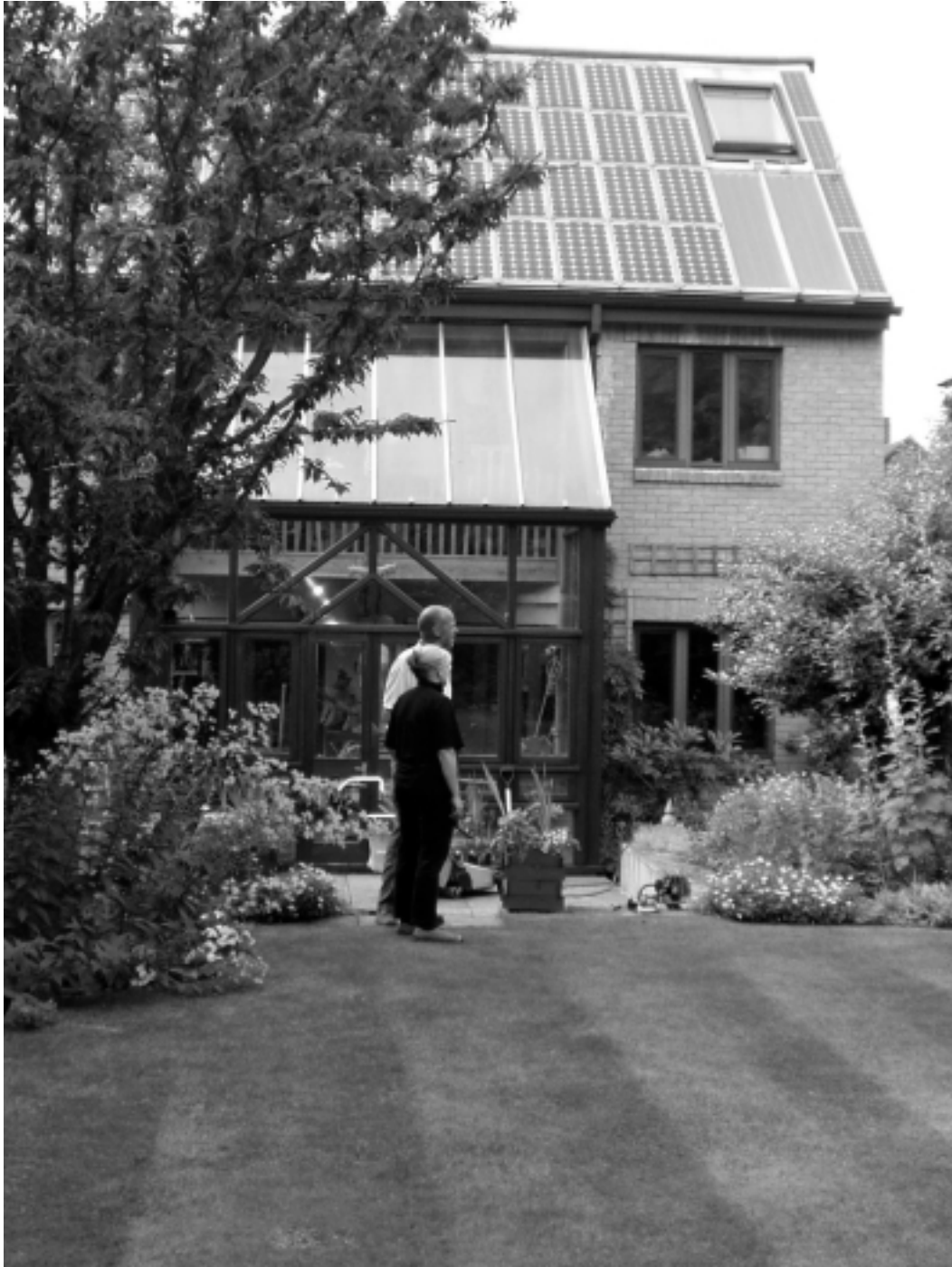
Figure 1. The Ecohouse designed by Professor Susan Roaf in Oxford, UK

Different ecohouses emphasise different qualities. The Chapman's house in Footscray in Melbourne is equipped with a solar hot water system, photovoltaic panels, a water collection and recycling system and energy efficient design. But the existence of the Rolls Royce of all sewage treatment plants at Werribee in Melbourne's West means that sewage composting with the Dowmus system, as in Mobbs's Sydney house, is unnecessary.