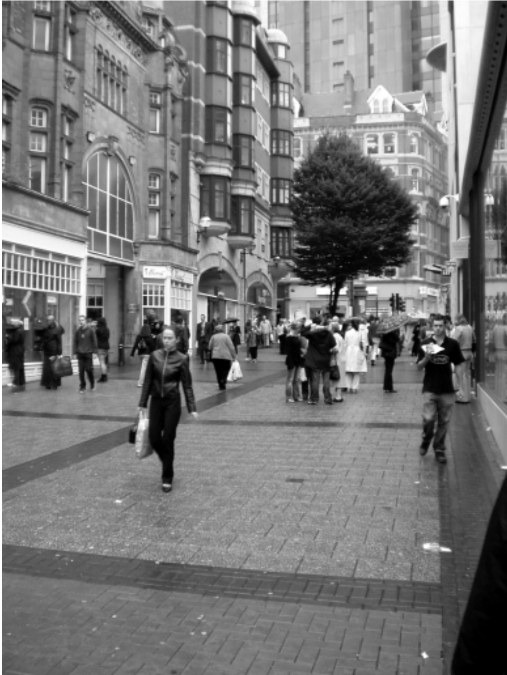
Figure 6 The CBD of the city of Birmingham, UK. This was once a congested traffic infested main street.

Birmingham is a Victorian city like Melbourne supporting the arts and music. It will never be beautiful — it is primarily a city of business. But the city is making the best of its urban environment and people flock to work and shop there. New developments around the Bull Ring are further extending the pedestrian area and linking it with New Street railway station. In a Foreword to the 2003 'Locate in Birmingham' brochure, architect Richard Rogers says 'A well designed sustainable city will attract people back into its centre ... A sustainable city is compact, polycentric, ecologically aware and based on walking'.