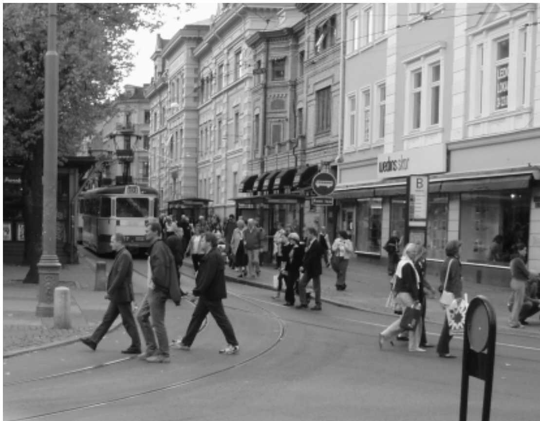
Figure 8 The City of Gothenberg in Sweden on European 'car free' day September 2003.

The very success of pedestrian precincts means that traffic tends to increase around the perimeter. This does not help sustainability or the quality of the environment beyond the precinct. The 'car-free' city limits car access to residents, and to businesses within restricted hours, and encourages much other travel to the centre by public transport. This 'area-wide access control' has been introduced in Bologna and Florence in Italy and Lübeck and Aachen in Germany. In Europe a 'car-free' day has been instituted every year in September in which cities actively discourage residents and visitors from using the car and promote walking and cycling activities. Figure 8 shows the central area of Gothenberg in Sweden on car-free day 2003. Mixed access may sometimes be allowed with vehicles limited to walking speed and on-street parking banned. Access to business vehicles is allowed for deliveries at certain times. Alternatively footways and roads may be separated but the width of the footway greatly increased, and road traffic restricted to 20 kph or less. Pedestrian crossings can be provided where cars have to give way to walkers at all times without traffic light controls.