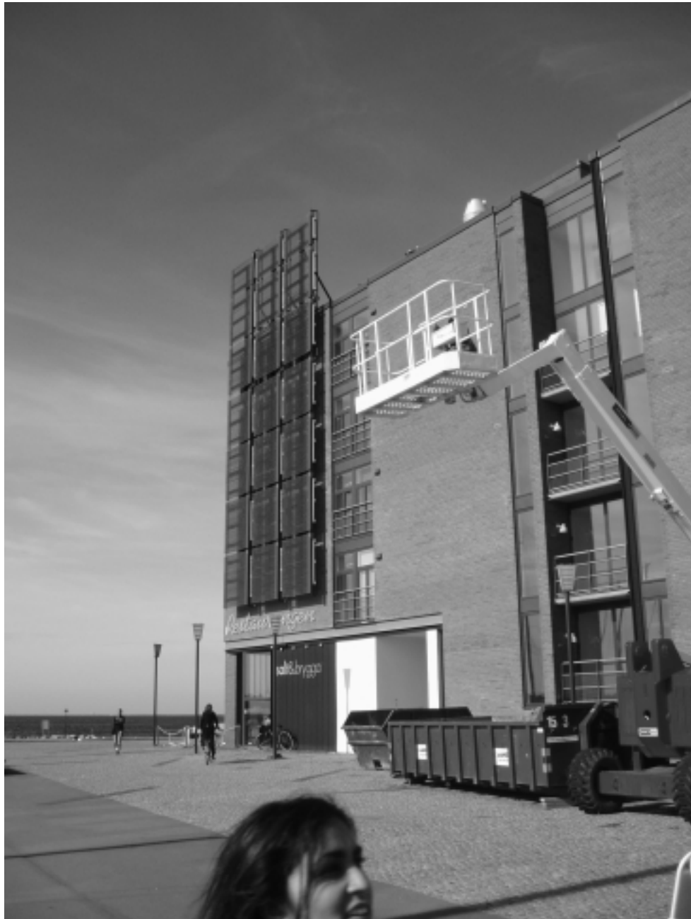
Figure 4. Alternative energy sources built into the housing. Vacuum tube, high performance solar hot water heaters, Västra Hamnen, Malmö.