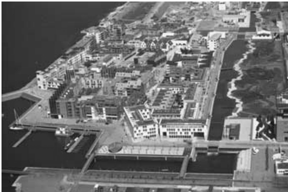
Figure 3 Västra Hamnen docklands development in Malmö, Sweden

Finally, the new suburb of Västra Hamnen in Malmö, Sweden, was designed as a 'city of tomorrow' in conjunction with Bo 01, the city's international housing exhibition of 2001 5 (Figure 3). The new neighbourhood is located on an industrial site formerly used by a major shipyard (Kockums) and the vehicle manufacturer Saab. When these activities contracted, a polluted wasteland was left behind. The new city district occupies old industrial land fronting the sea on one side and the harbour on the other. The district will eventually combine housing for between ten and twenty thousand people with commercial and social services. The section already built is a new neighbourhood built on the most attractive seafront site with 559 dwellings consisting of houses, terraces and blocks of flats up to six stories. The six storey flats are built along a seafront promenade and boardwalk with a breathtaking view across the Öresund (The Sound) to Denmark and the bridge to Copenhagen. These flats also provide a felicitous and necessary barrier against the wind and weather, providing a calmer interior for the neighbourhood which contains smaller scale houses and flats.