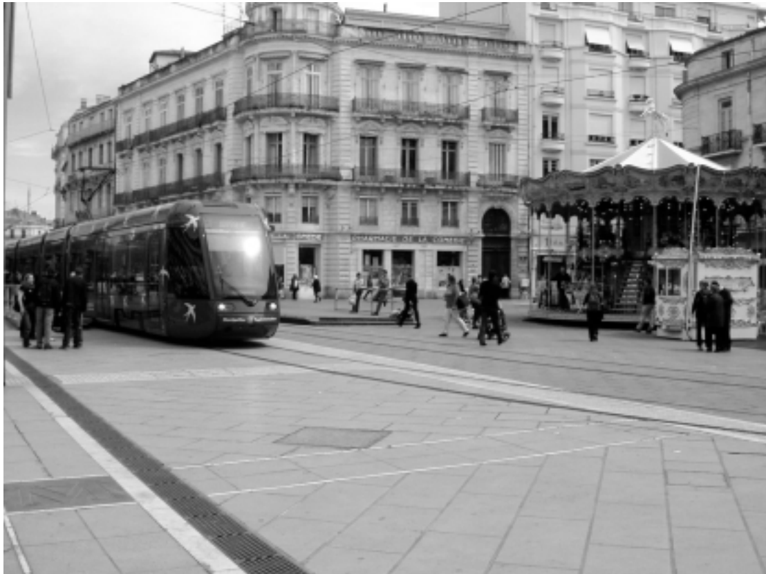
Figure 7 Montpellier's modern tram system sweeps suburbanites right into the walking-based CBD quickly and frequently.

Montpellier in southern France is a very different sort of town from Birmingham. Its renaissance city centre occupies a plateau ('L'Écusson: the escutcheon) rising above the surrounding town (Figure 7). All the streets surrounding the huge Place de la Comédie and the square itself are banned to vehicle traffic except for a tramline which connects the pedestrian centre to the suburbs and flows quietly among the walking traffic. The mixture of trams and walkers seems to be entirely safe and workable, as can also be seen in the pedestrian main shopping street of Zürich, the Bahnhofstrasse.