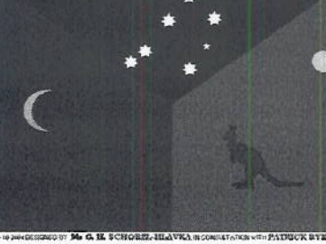
WILL THIS BECOME AUSTRALIA'S NEW FLAG?