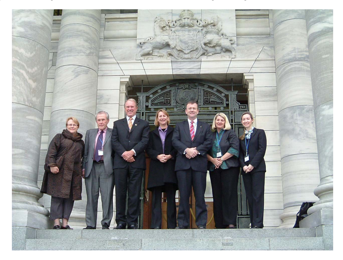
Figure 1.1 Delegation members at the Parliament House Buildings, Wellington

provides commentary on the Commerce Select Committee's inquiry into housing affordability. The diversification of New Zealand Post Group's activities into banking is also briefly discussed.