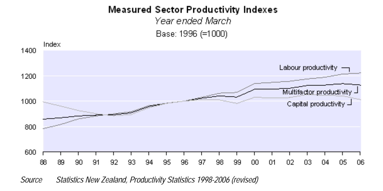
Figure 2.2 Measured sector productivity indexes year ended March 2006: base 1996 = 1000

this issue on a larger scale – Australian productivity averages 30 per cent more than New Zealand's.