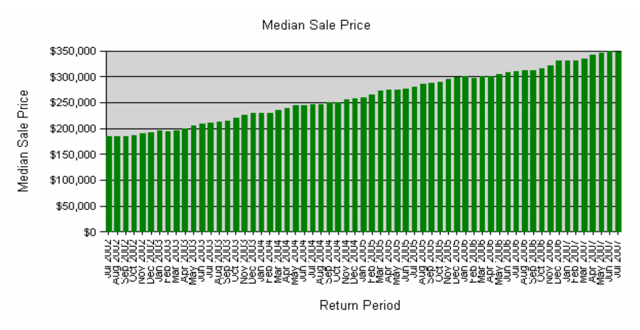
Figure 2.3 Median selling prices of dwellings in New Zealand between July 2002—July 2007