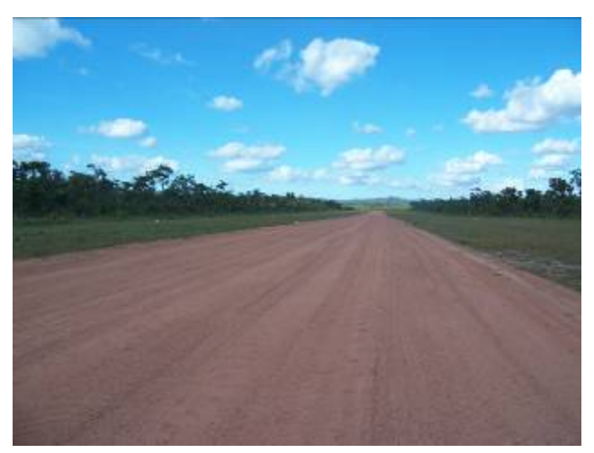
Chuulangun airstrip

A community approach needs to be taken into consideration with government policies and programs through a better coordinated whole of government approach. There should be less separation of Indigenous from mainstream programs. For example, Wild River Rangers should be open to both Indigenous and non-Indigenous people and organisations.