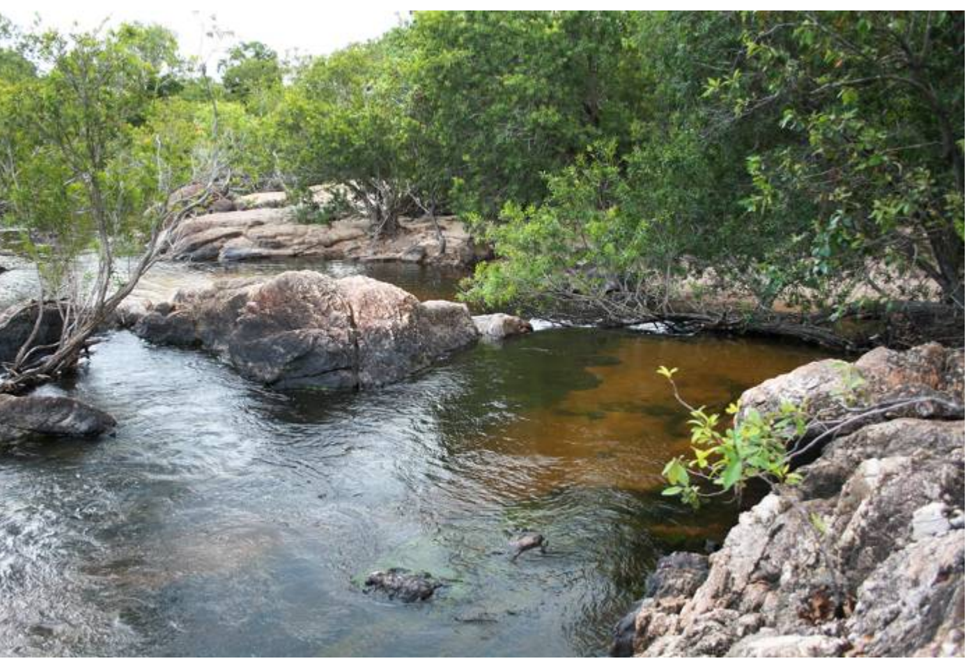
Upper Wenlock River near Chuulangun

The Wenlock Basin Wild River Area took effect on 4 June 2010 and the Pascoe River has been targeted for nomination under the Queensland Wild Rivers Act. In May 2009 the Chuulangun Aboriginal Corporation presented a submission to the Queensland government supporting the Wenlock Basin declaration and we will also support a wild river declaration for the Pascoe Basin. As outlined in our submission to the Queensland government, and our submission to last year's Senate Inquiry into the Wild Rivers (Environmental Management) Bill, wild river areas on our homelands are consistent with our economic development, homelands development and land management aspirations. The Wild Rivers Act in no way diminishes our right or ability to live and work on, undertake sustainable economic development, and control the management of our traditional lands and waters.