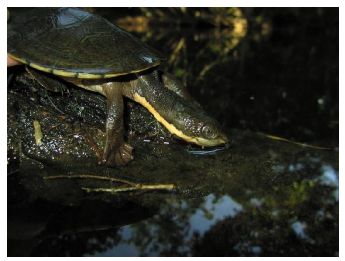
Freshwater turtle, Elseya latisternum