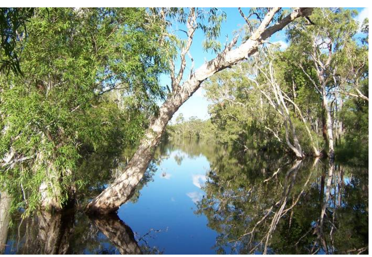
Mountain spring-fed lagoon, upper Wenlock River

Other relevant acts that need reform are mining acts and special agreements acts. In regard to the Wenlock Basin Wild River Area, special water allocation rights have been given to mining companies, namely Rio Tinto Alcan at Weipa on the west coast of Cape York Peninsula. Such Special Agreement Acts are inconsistent with the wild river declarations, and should be rescinded. There is a need to reform the Minerals Act to recognise Traditional Custodians rights to and management of country. Ideally, the recognition of Indigenous rights and interests in land, water and resources should be incorporated into all Acts of government. Hopefully, the decision of the Gillard government to work towards the formal recognition of Indigenous people in the Constitution will be the first step towards ensuring this happens.