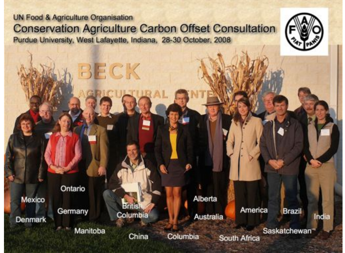
Source: This summary document was derived from the Conservation Agriculture Carbon Offset Consultation, attended by approximately 80 scientists and stakeholders, including Carbon Farmers of Australia, on 28-30 October 2008, at the Beck Agricultural Center in West Lafayette, Indiana, USA. The Consultation was sponsored by the United Nations Food and Agriculture Organization (FAO) and the Conservation Technology Information Center (CTIC), with technical support from United Nations Framework Convention on Climate Change (UNFCCC) staff.