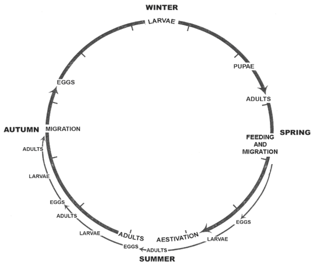
Figure 3. – Probable life cycle of the Bogong moth (after Common 1954:fig.12).

The mountains of the ACT become staging posts in autumn for migrating moths moving from mountains further south. From there, they travel in a span of directions between west and north-north east. The adult moths don't necessarily return to exactly the same place from where they emerged, but fly back to areas suitable for egg laying.