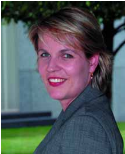
Tanya Plibersek (Sydney, NSW).

So did those migrants who were escaping repression imbue their children with a particular attitude towards public service? Was there a sense that the children should be grateful to the country that had taken their parents in?