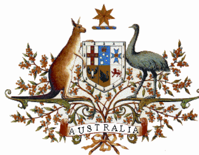
The Australian Coat of Arms

A Constitutional Convention was held in February 1998 to consider whether or not Australia should become a republic. After a majority of delegates voted in favour of a republic, constitution alteration bills were passed by the Parliament containing changes to the Constitution necessary to put into place the republican model most widely supported at the Convention. However, these proposals were unsuccessful at referendums held in November 1999.