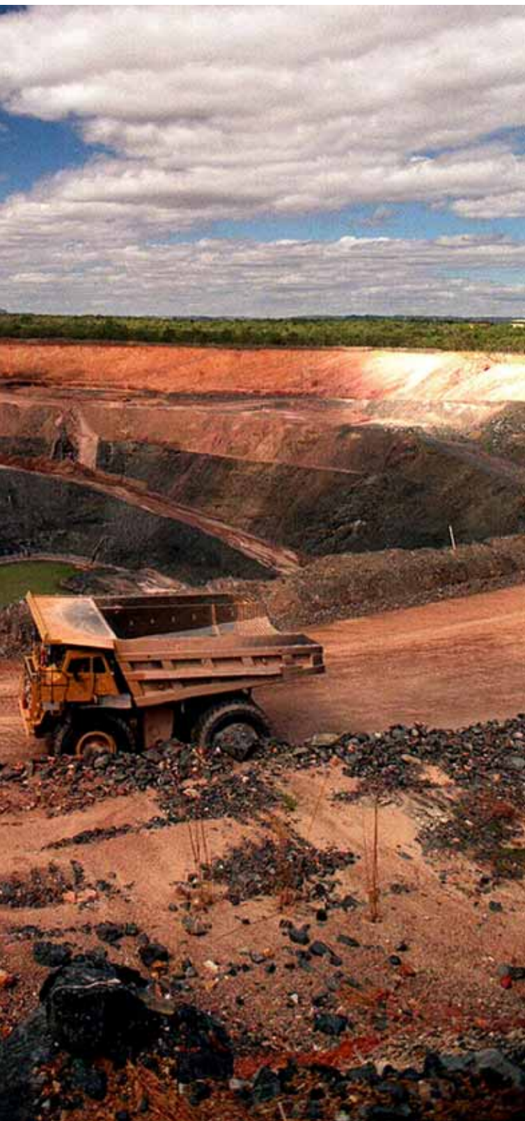
Ranger uranium mine (NT).

coal are produced annually and this is projected to increase to 7 billion tonnes by 2030.