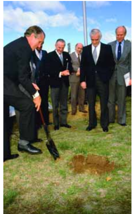
“This building is beyond the fashion of a certain moment in time.”

Giurgola is stung by criticism from some quarters that the symmetry of Parliament House makes it the last