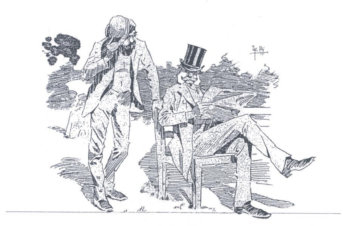
IN SYDNEY DOMAIN

"EXCUSE MY INTERUPTION, BUT MAY I ASK IF YOU ARE A MEMBER OF PARLIAMENT?" "NO, SIR; I AM A GENTLEMAN