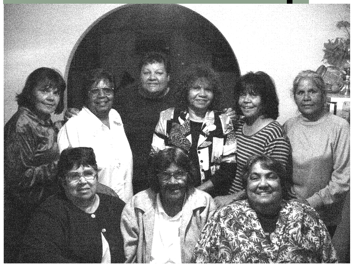
6 Etna Avenue Pennington South Australia 5013